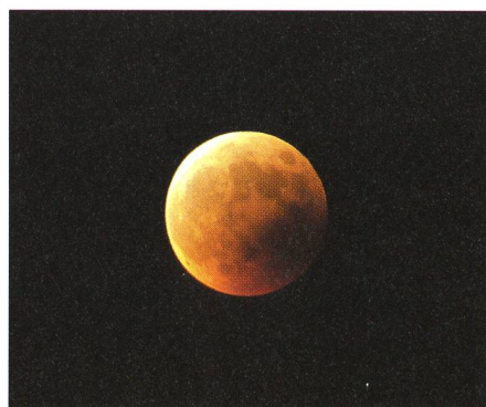
2003-901-03: 0352 UTC Film: Fuji NPH (ISO 400); Exposure: 8 seconds.