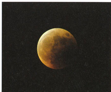
2003-901-04: 0352 UTC Film: Fuji NPH (ISO 400); Exposure: 4 seconds. This is close to the naked-eye appearance of totality at this time.