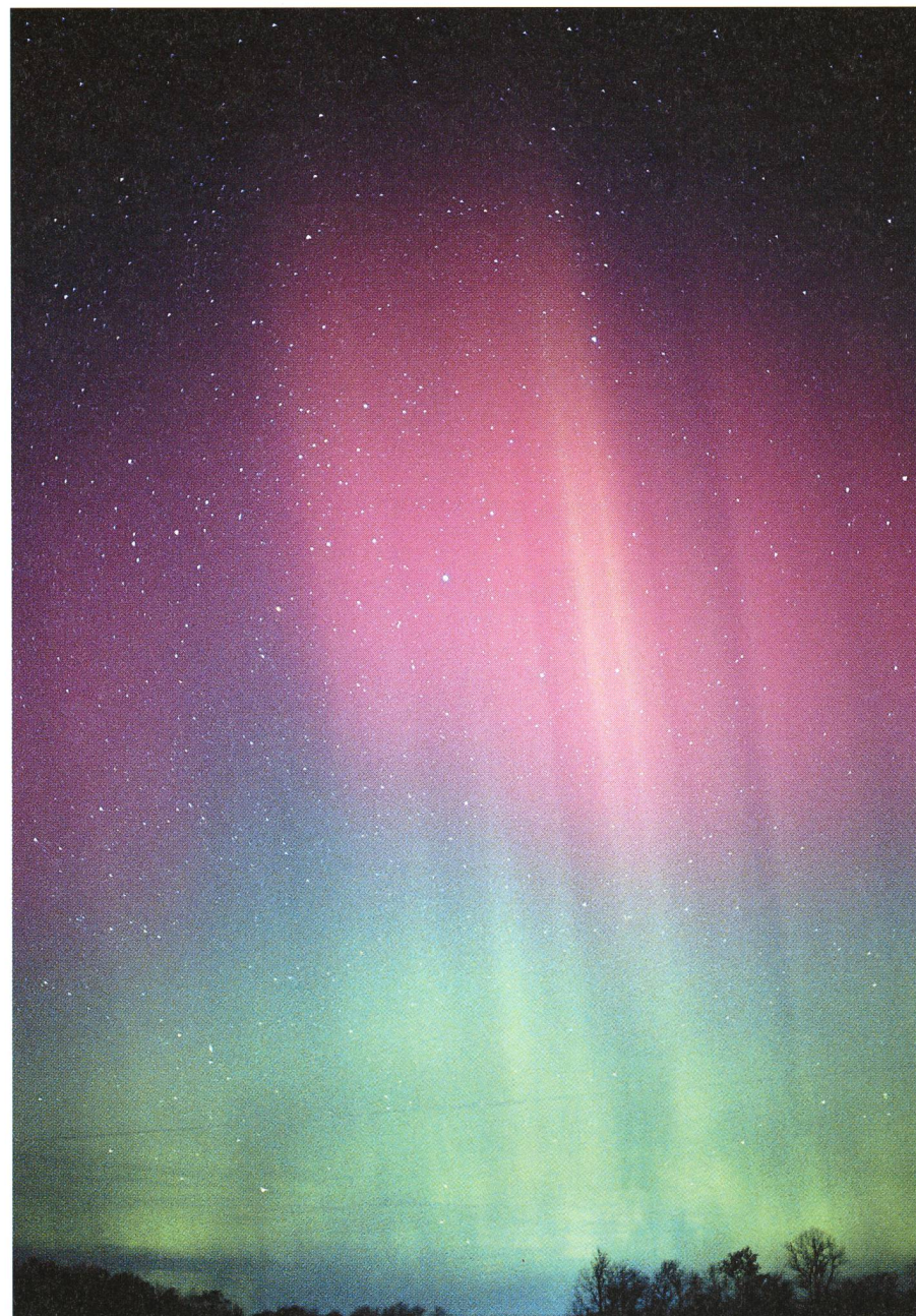
Fig. 1: Aurora of 28 October 2001.

The aurora covered about 70 degrees of azimuth centered on north. It took about 45 minutes for a major feature within the aurora to cross from northwest to northeast.