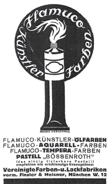
Fig. 4 Advertisement of Vereinigte Farben- und Lackfabriken vormals Finster und Meisner (The Unified Paint and Enamel Factories formerly Finster and Meisner), 1927. (Reproduced from Technische Mitteilungen für Malerei 43(1), 1927, p. 11.)

mentioned in the photographic literature around 1905. Unlike many earlier inventors, Buss made strict distinctions between the function of a binding medium and that of a photosensitive layer. He worked out a method to prepare only the binding medium, a casein (a natural emulsion of milk fat in water) layer, which was described in an article in the Journal of the Society of Chemical Industry as follows: