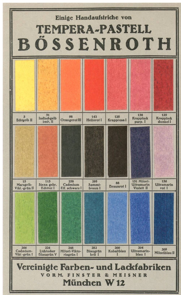
Fig. 2 Colour chart with Bössenroth paints. (Reproduced from Trillich 1925, after p. 96.)

Emil Jacobsen, who had solved the Erbswurst problem, later invented a vehicle for tempera painting which was subsequently produced commercially. He called it 'Aquolin', a name derived from the Latin for water ( aqua ) and oil ( oleum ). Its main advantage was that any category of paint mixed with the Aquolin medium could be applied on nearly all types of surfaces, regardless of whether they were rough or smooth, lean or greasy. To set the paint layer and to make it water resistant, for the finishing step a wax/resin fixative was applied over it with a brush. Jacobsen himself described his medium as 'a composition of albumen-like and soap-like substances with emulsified fats' (Anonymous 1893a; see also the contribution by Pohlmann et al. , in this volume). Painting with Aquolin was similar to painting with the so-called Weimarfarbe (Weimar paint), an artists' paint based on an oil/resin medium which could be transformed into water-miscible soaps during the painting process (Feuchter-Schawelka 2005; Pohlmann 2012a, pp. 186–187) by adding the vehicle Feigenmilch ('fig milk'), which was not natural fig latex at all, but rather an artificial composition of several substances, mainly soaps (Fig. 1; see also the contribution by Pohlmann et al. , in