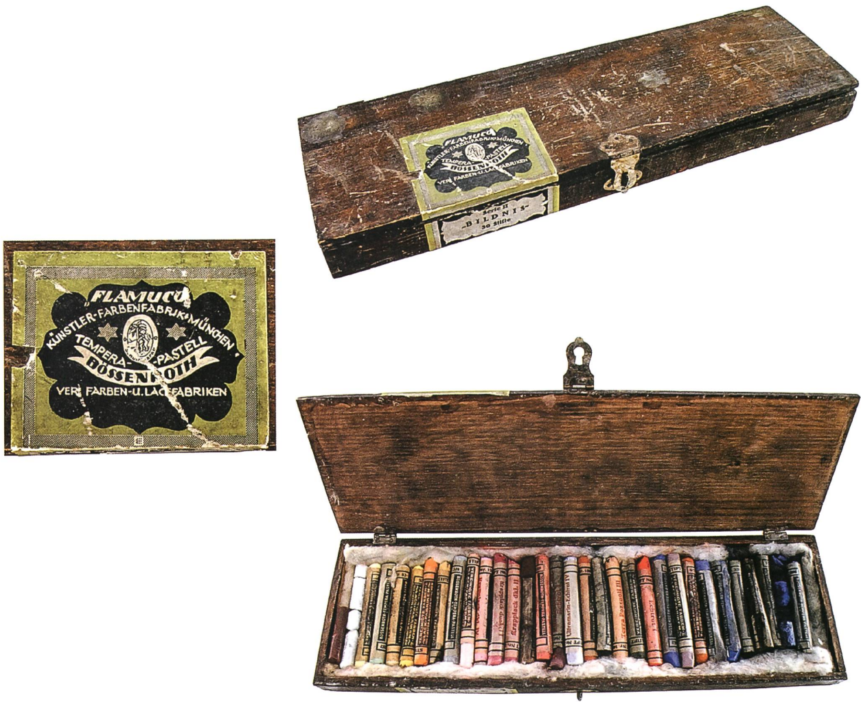
Fig. 5 Box with Tempera-Bössenroth pastel sticks, assortment 'Portrait'.

Unlike other formulations, Bössenroth's invention was a success. The manufacture of Tempera-Pastell was carried out by the Munich-based company Vereinigte Farben- und Lackfabriken vormals Finster und Meisner (The Unified Paint and Varnish Factories formerly Finster and Meisner) (Fig. 4). It was advertised as one of their main products until 1943; the last known advertisement for Tempera-Pastell appeared in a catalogue from the Haus der Deutschen Kunst (House of German Art) from that