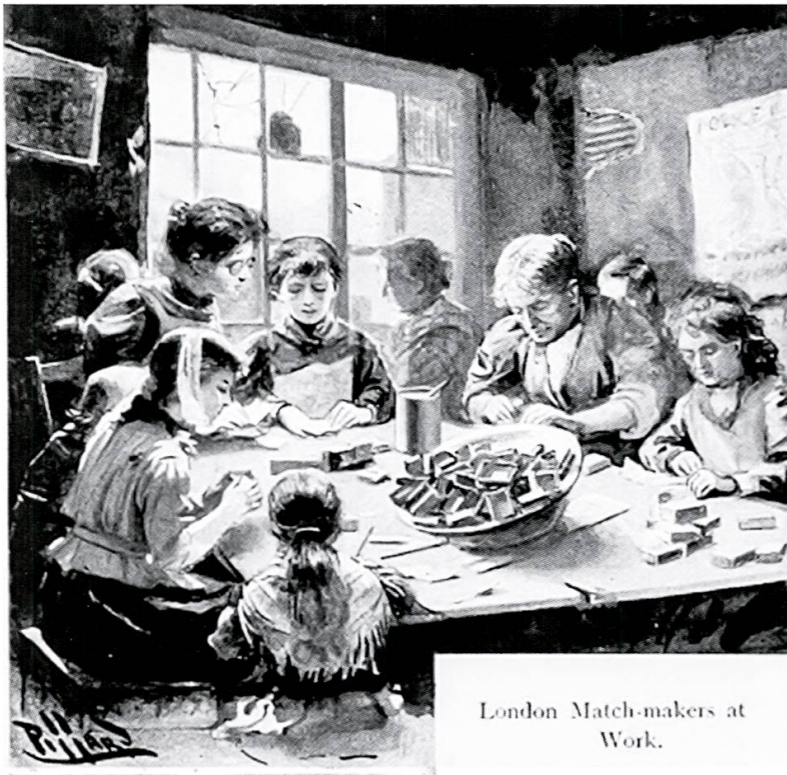
London matchmakers at work (1905); Streichholz-Arbeiter in London (1905). (Robert H. Sherard's Child Slaves of Britain . London: Hurst and Blackett, 1905, p. 52)

period about groups that were perceived to be vulnerable, but it is important to bear in mind that Evangelical thought on these issues was varied. 8 As Boyd Hilton has observed, market downturns, inequitable labour contracts and workplace accidents could just as easily be seen as manifestations of divine providence. 9 With this view in mind, many Christian reformers in 1830s and 1840s Britain argued against interfering in God's will – unless, perhaps, women and children were adversely affected. Thus, Lord Ashley called women's factory work an «evil» to be avoided, yet also campaigned for the limitation of work hours in general on the ground that it would increase productivity. 10