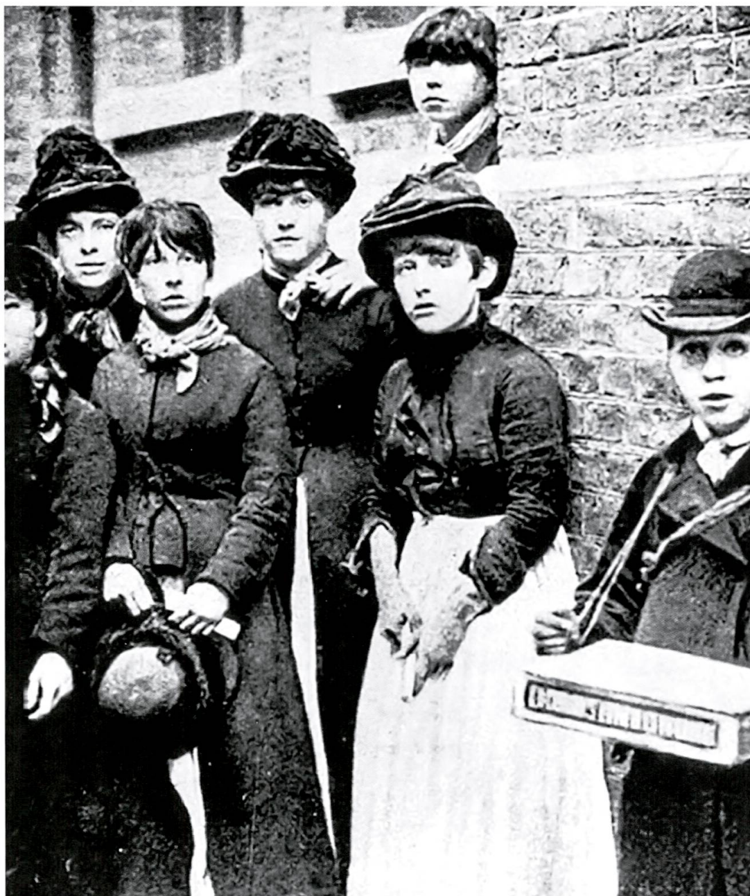
The Matchgirls' Strike at Bryant und May, London (1888); Der Streik der Streichholz-Arbeiterinnen von Bryant und May in London (1888).

gium. Since labour markets seemed to follow universal economic doctrine, the solutions to problems in those markets could, in principle, also be universally applicable. 28