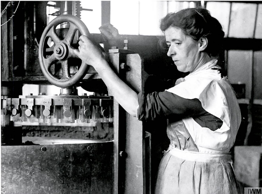
Women's Work in Britain during the First World War; Frauenarbeit in Grossbritannien im Ersten Weltkrieg. (Wikimedia Common's)

A wave of strikes in the mid-1880s, including the widely publicised match girls strike of 1888 shed new light on the dire working conditions – including, in the case of the match girls, regular exposure to toxic phosphorus – to which Britain's working classes were subjected. While the wave of strikes would subside by the end of the 1880s, the link between the labour question and the social question continued to inform British discourse into the early twentieth century. It could be seen for example in the establishment of the Labour Party in 1900. A number of legislative responses attempted to address concerns about poor working conditions and unjust contracts. For example, a Royal Commission on Labour was established in 1891, and new medical inspectors of factories were instituted shortly thereafter, while a series of social insurance reforms were implemented between 1897 and 1911. Most of these reforms drew on the social-scientific research by Booth, Rowntree and the Fabians, including the pathbreaking work on wages and poverty by Sidney and Beatrice Webb. For the Webbs, the labour question could be solved through careful observation of the market and the creation of labour exchanges that emulated those in practice in Germany and Bel-