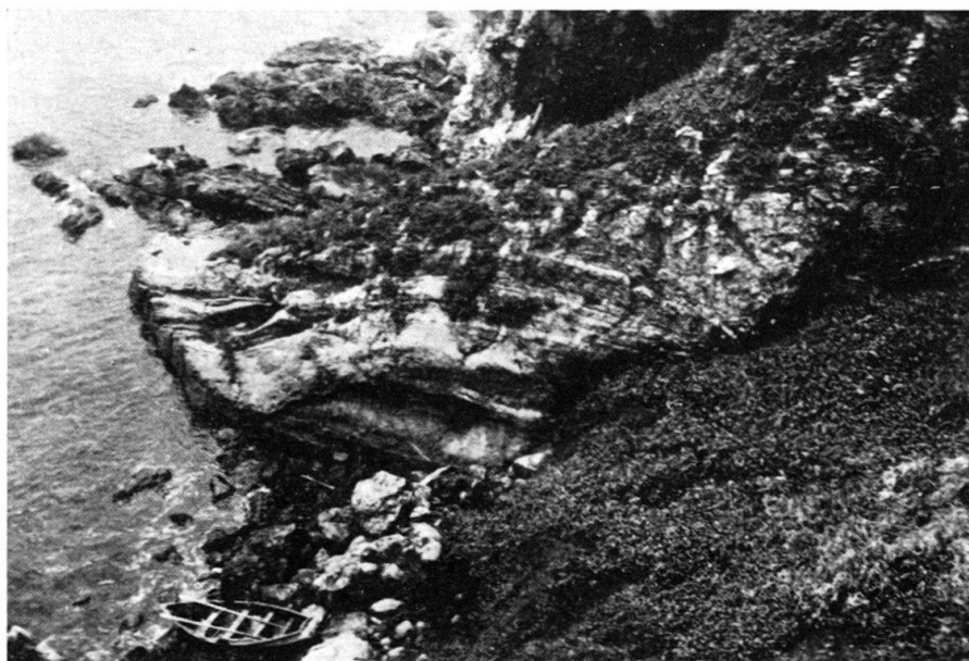
Fig. 5. Landing place with orbitoidal limestone (B-3) of Bed 10.

Bed 10 is built up mainly of layers of grey glauconitic orbitoid marlstone with intercalated softer marls. The lowest 4 meters are composed almost entirely of the tests of orbitoids and colonies of calcareous algae ( Lithothamnium s.l.), fine brecciated rubble of the same material and echinoids. Typical of the lower part are the samples Rz.251, J.S.1024, K.903, K.1500 (all in square B-3 of the map).