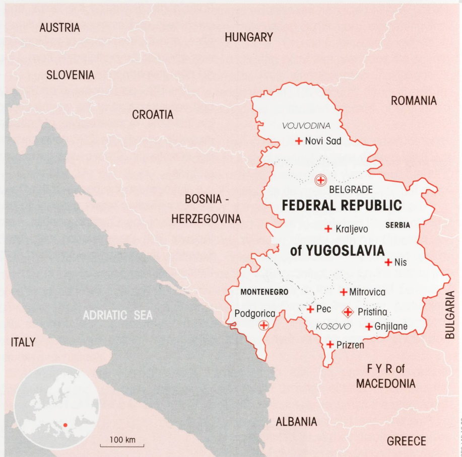
⊕ ICRC delegation ⊕ ICRC sub-delegation/office ⊕ ICRC mission ⊕ ICRC field office

For the Federal Republic of Yugoslavia, the year ended as it had begun - with tension and violence. Serbs and ethnic Albanians failed to settle their differences over Kosovo during talks held at the beginning of the year in Rambouillet, on the outskirts of Paris. The implications of the conflict extended well beyond the Balkans since the collapse of the Rambouillet negotiations was followed by a series of air-strikes on targets in Serbia and Kosovo by NATO member countries. Much of the country's infrastructure was shattered and the region teetered on the brink of economic and monetary collapse. In the largest population movement in Europe over the last 50 years, hundreds of thousands of ethnic Albanians fled, mainly towards neighbouring Albania, the former Yugoslav Republic of Macedonia and Montenegro. After the cessation of NATO air strikes, waves of displaced people then poured back into Kosovo to find their homes and fields destroyed. In accordance with UN Security Council resolution 1244, Kosovo was placed under the authority of UNMIK.*