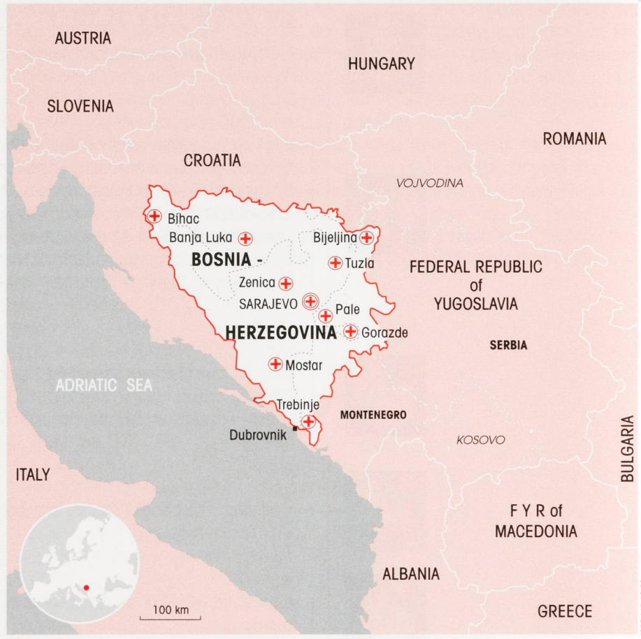
⊕ ICRC delegation ⊕ ICRC sub-delegation/office - - - - Inter-Entity Boundary Line

Four years after the General Framework Agreement for Peace ended the war in Bosnia-Herzegovina, political and economic gains in the region have remained modest. The conflict in Kosovo spilled beyond the borders of the Federal Republic of Yugoslavia as Bosnia-Herzegovina struggled to absorb thousands of refugees from the province and from Serbia proper. The arrival of the refugees put a damper on the tenuous efforts by State administrators to lay the foundations of a peaceful civil society and caused the region to slide deeper into economic insolvency. Despite injections of financial aid from the international community, the country's underfunded social safety net was unable to cope with the problems posed by the new arrivals. Although both the country's entities - the Federation of Bosnia-Herzegovina and Republika Srpska - were affected by events in Kosovo, the latter's economy was hit harder, since close economic ties with the Federal Republic of Yugoslavia meant that out of a workforce of 250,000 people, an estimated 50,000 lost their jobs after the NATO bombings began. The psychological cost of the conflict was incalculable, particularly in Republika Srpska where many people had relatives in Serbia.