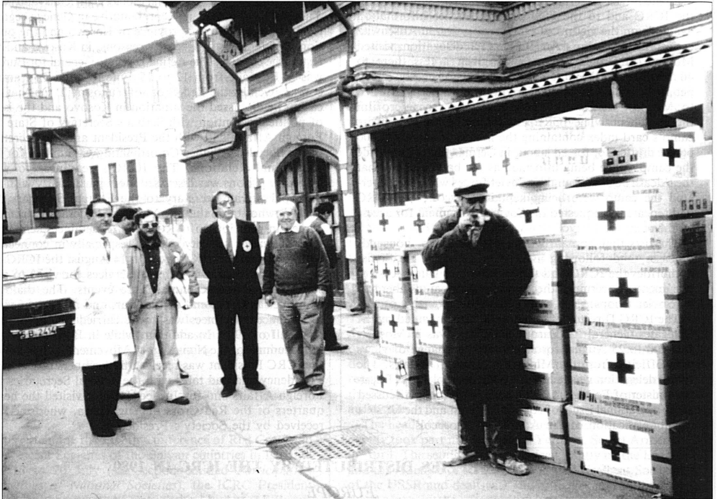
Medical assistance to a hospital in Bucharest (Romania).