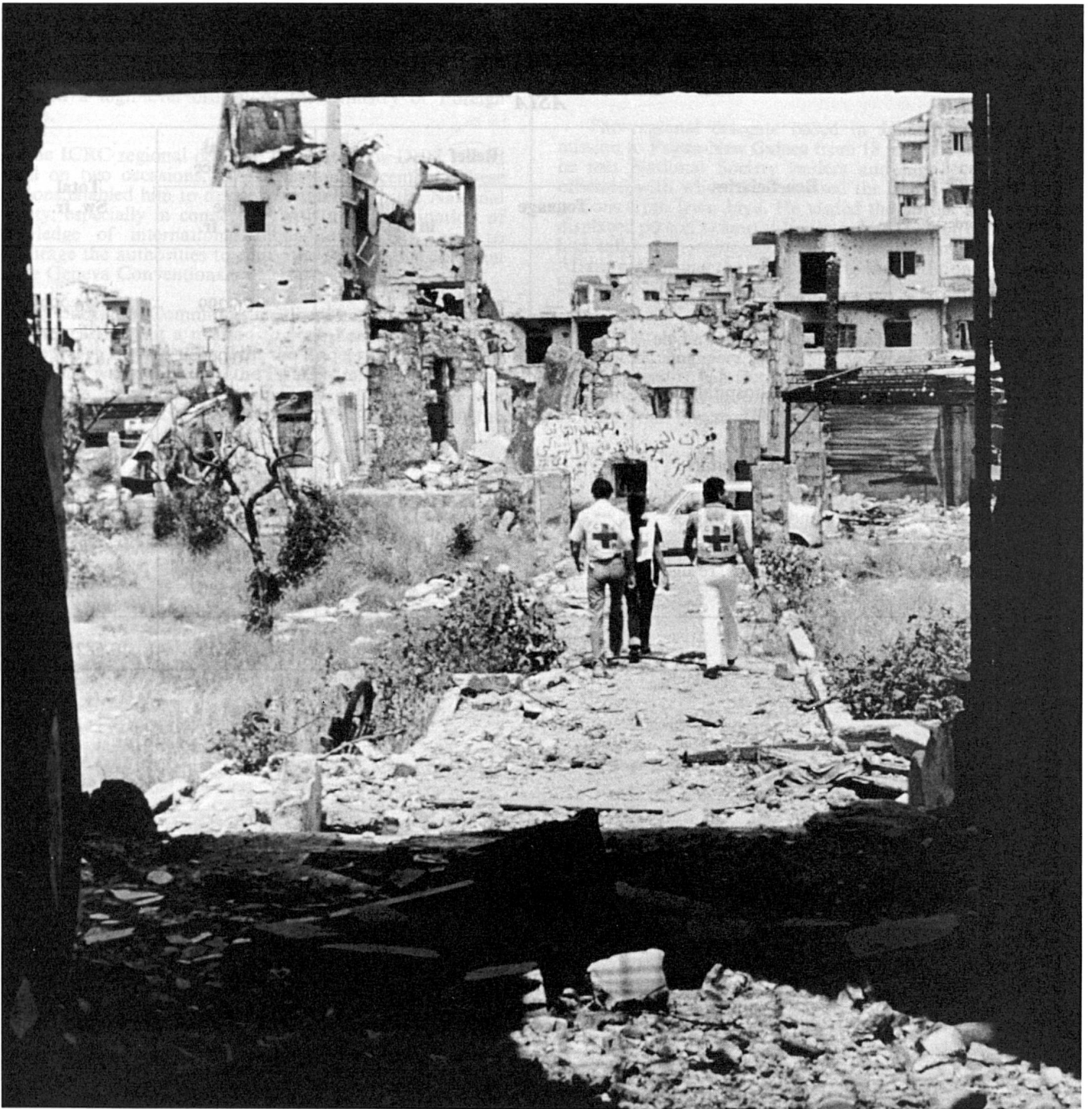
Assessing the needs of a heavily damaged neighbourhood in a Beirut suburb.