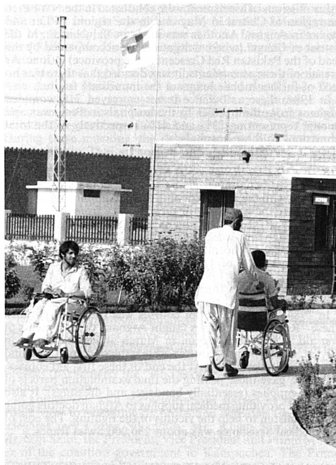
The ICRC paraplegic centre in Peshawar.

ASSISTANCE FOR AMPUTEES. — The orthopaedic workshop in Peshawar, set up in November 1981, continued to supply prostheses to patients at the surgical hospitals of Peshawar and Quetta, and to other Afghan war wounded. In 1984, locally recruited and trained craftsmen made prostheses or appliances for 572 patients under the supervision of an ICRC specialist. The ICRC orthopaedic workshop also started producing rubber feet from October onwards; until then, prostheses of this kind were imported from Jaipur in India. When the paraplegics were moved to the new centre (see above), the ICRC made use of the old premises to install a re-education centre with a capacity of 30 beds, for patients needing to try out or learn to use prostheses made for them.