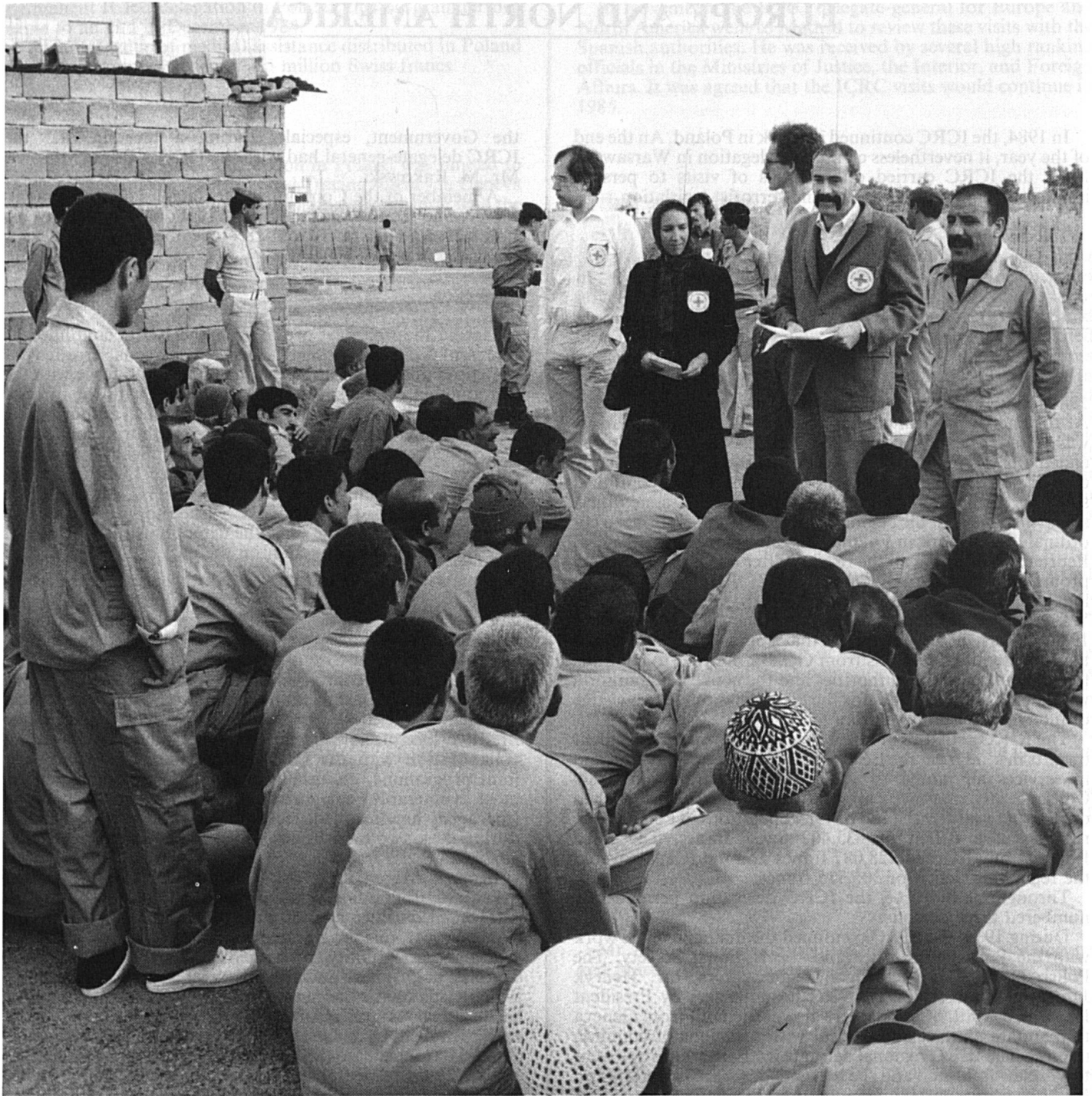
Iraq: Iranian prisoners of war grouped together before being repatriated, via Ankara, under the auspices of the ICRC.