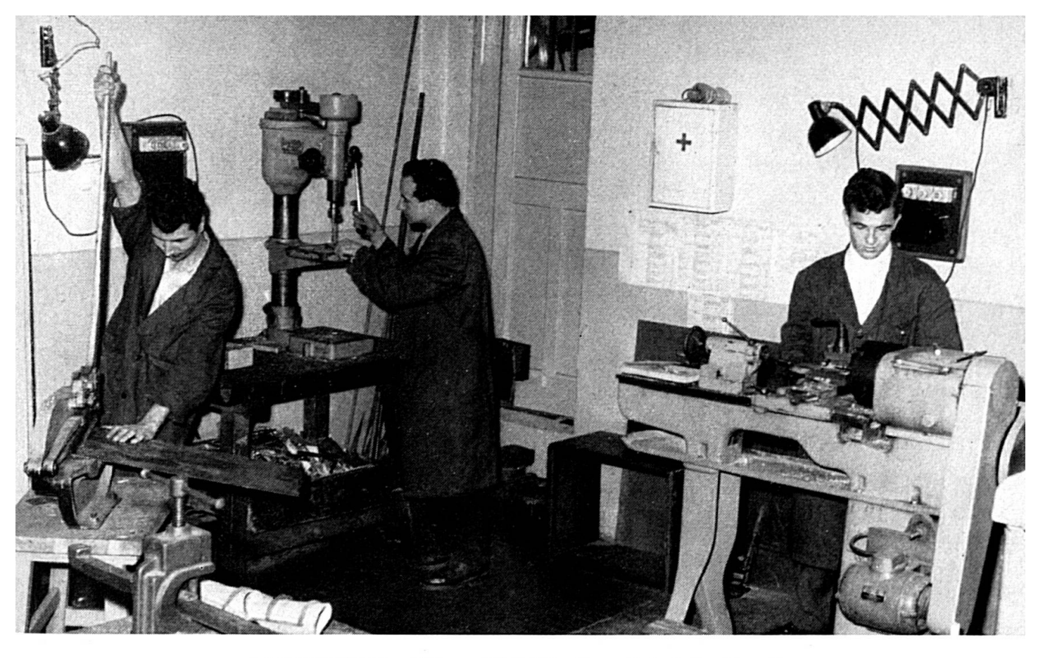
YUGOSLAVIA The artificial limb workshop in Sarajevo.