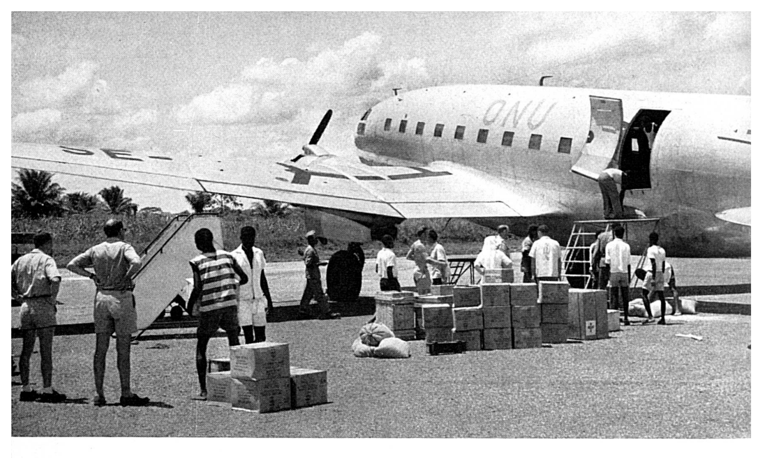
CONGO Foodstuffs and medical supplies for the hospital at Gemena being unloaded from a United Nations aircraft placed at the disposal of the ICRC and accompanied by a delegate.

ALGERIA The screening and transit centre in Barika.