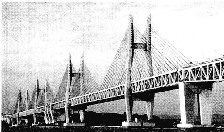
Fig.2 The Hitsuishijima and Iwagurojima Bridges

During the 1980s the development also included composite girders and for a period of five years the Alex Fraser Bridge with its main span of 465 m became the record-holder.