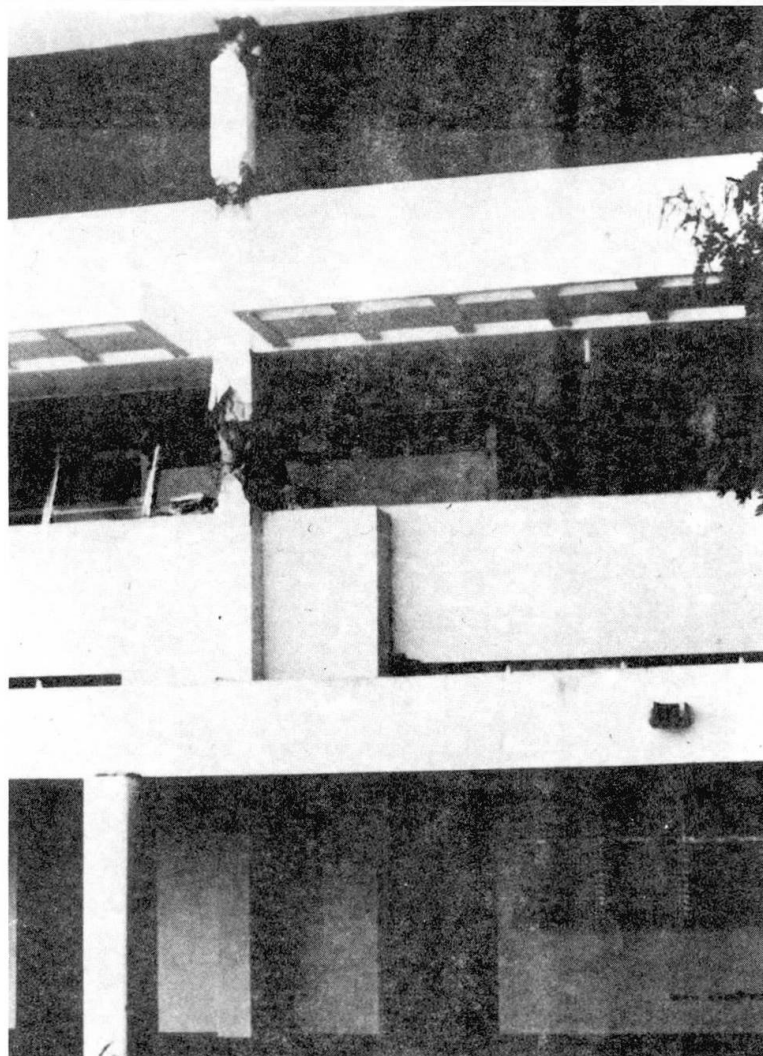
Figure 1. Colegio Teresiano in Managua, Nicaragua, after 1972 earthquake. First story stiffening wall, which can be seen projecting outward from second floor beam, prevented first story damage but increased upper story damage.