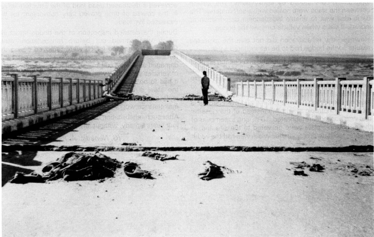
Fig. 1 Top view

It was decided to restore the bridge, as similar floods were not anticipated for a long period. Boulders in steel wire crates were dumped in the form of flexible garland around the affected well No. 3 to increase its stability and reduce the chances of further scour of bed. The pier was strengthened by concrete jacketing, so that it could withstand the loading in tilted position of well and pier.