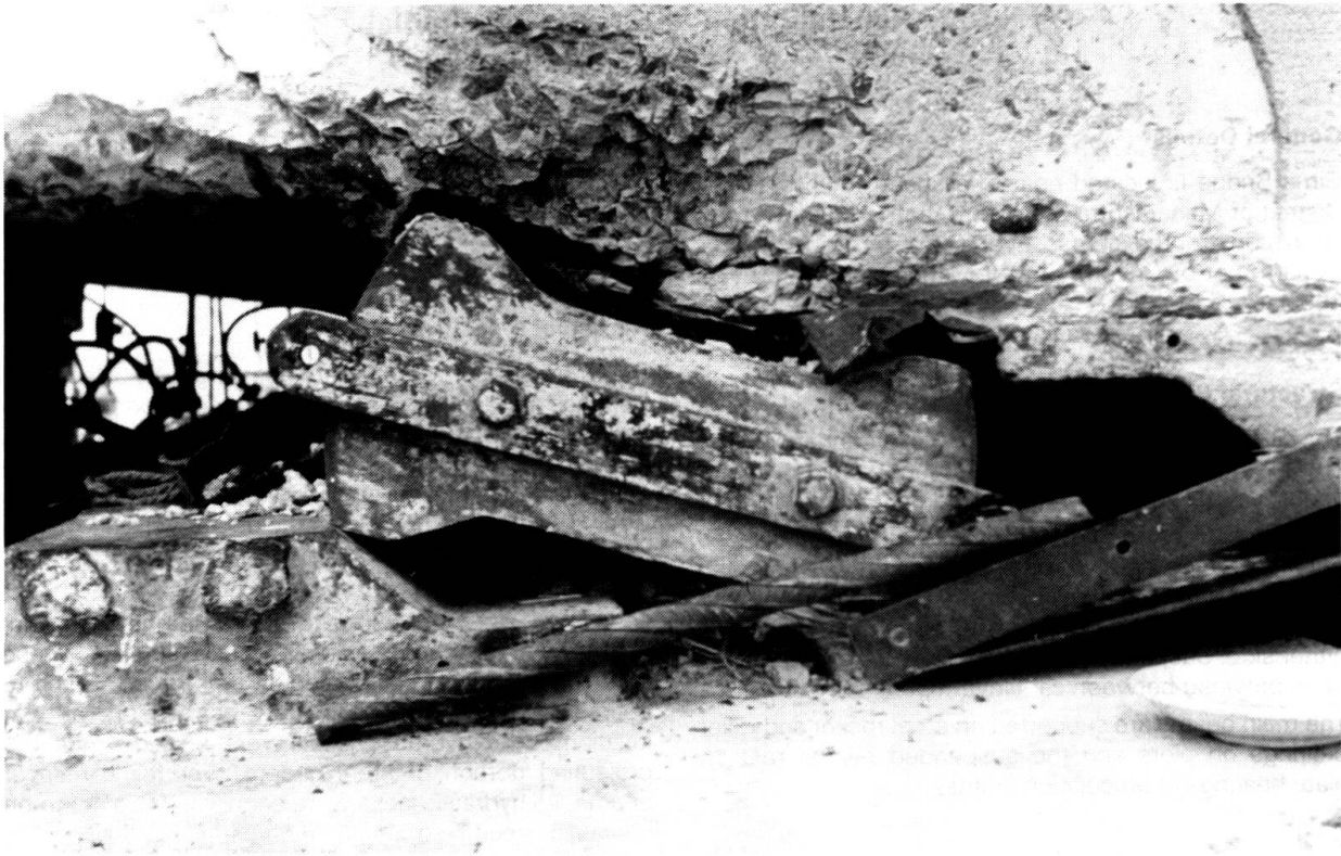
Fig. 2 Position of segmental roller bearings

The well cap was also strengthened. Six numbers steel supports were erected from the well cap for lifting of the box girder. Each box girder was provided with two lifting points, one on either side of the pier. The large diameter Hydraulic Jacks of 200 tonnes capacity with safety nut arrangement were used for lifting the weight of 800 tonnes. In addition to the jacks stand-by support points were provided. Steel packing was provided over these support points continuously during lifting operation.