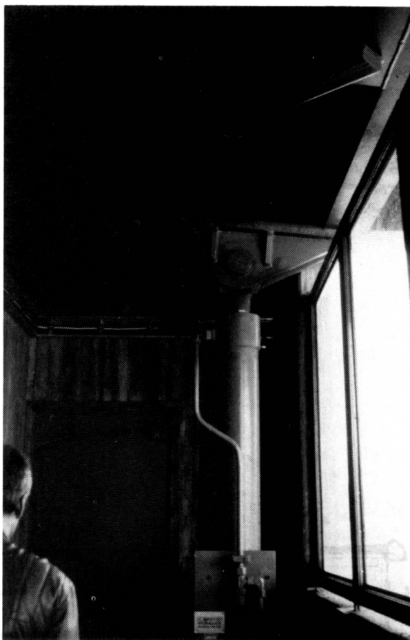
Fig. 4 Hydraulic cylinder