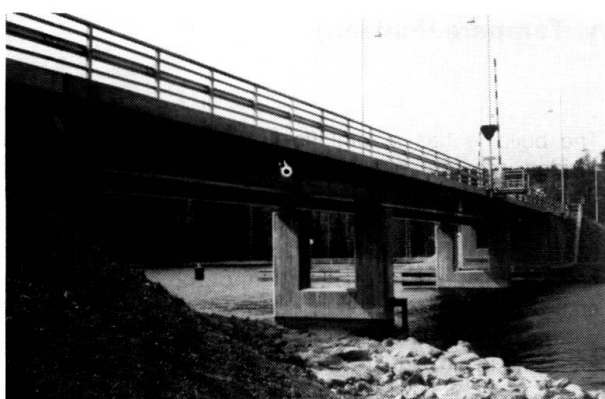
Fig. 3 General view of the bridge

The forward end of the leaf rests on an elastomeric pad-bearing and at the abutment end it is supported by two fixed spherical trunnions (steel spherical sliding bearings). In addition to the trunnions, the leaf is, in the opening and closing stage, supported by hydraulic cylinders at each main girder. The cylinders are fixed at a point situated at 1.8 m distance from the trunnion axis. The maximum opening angle is 81 degrees.