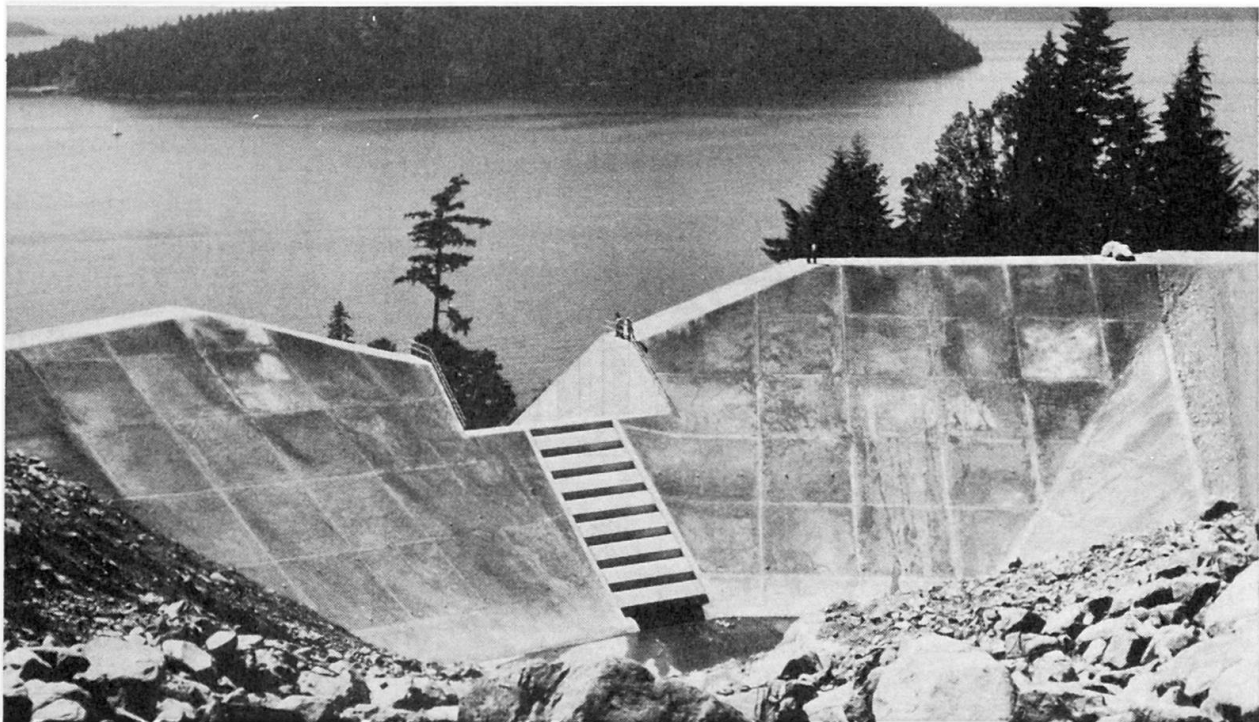
Fig. 1 Fill type debris barrier

At one location, a barrier was not feasible and a 800-m long channel with an average grade of 31% was designed to convey the torrent through the residential community to the sea. The 5.6 m by 13 m concrete channel cost approximately $ 3,500/m (CDN.) and the integral earthworks, secondary retaining walls, and eight