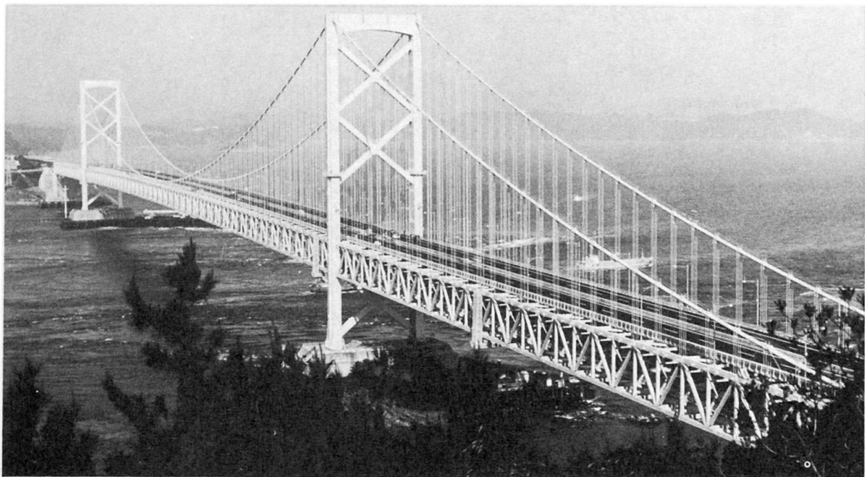
View of the Ohnaruto Bridge

Structural dimensions of the stiffening truss are determined after they are confirmed to guarantee the aerodynamic stability against the design wind speed by the means of a wind tunnel test.