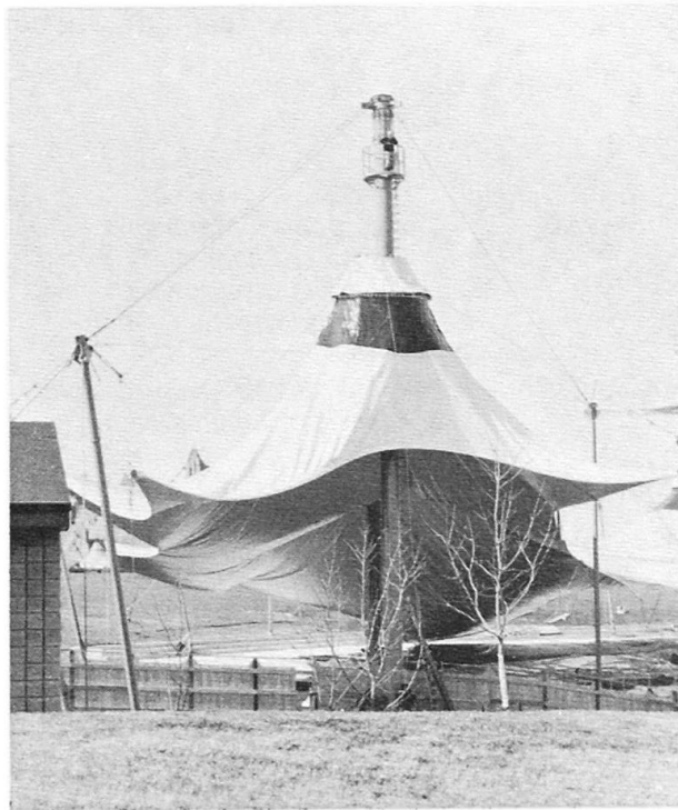
Fig. 4 Raising membrane