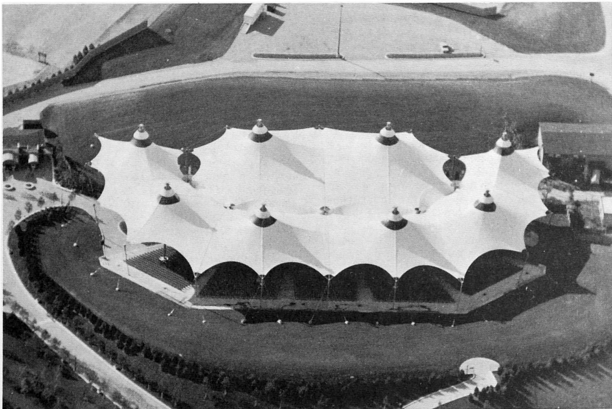
Fig. 3 Areal view