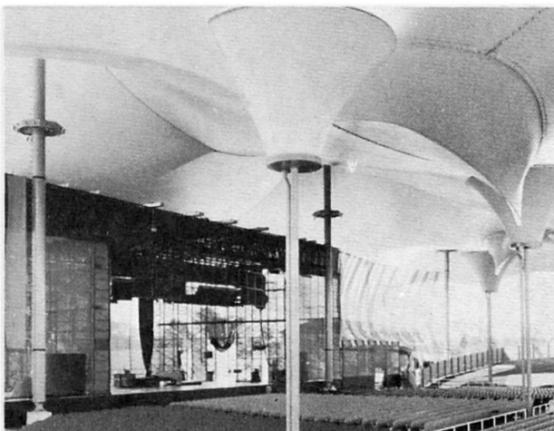
Fig. 1 View of performance area

The traditional method of resisting guy cable tension has been the use of mass concrete anchor blocks. At Kingswood the large number of anchors and the high magnitude of the forces would have made the use of mass concrete footings very expensive. The dense glacial till, which underlies the site, provided an excellent opportunity to use battered belled caissons to mobilize soil weight and resist tension forces. This system used approximately 1/6 of the concrete volume that would have been used for mass footings at 1/3 the cost (Fig. 2). A total of approximately 200 m 3 of concrete was used for the tent foundations.