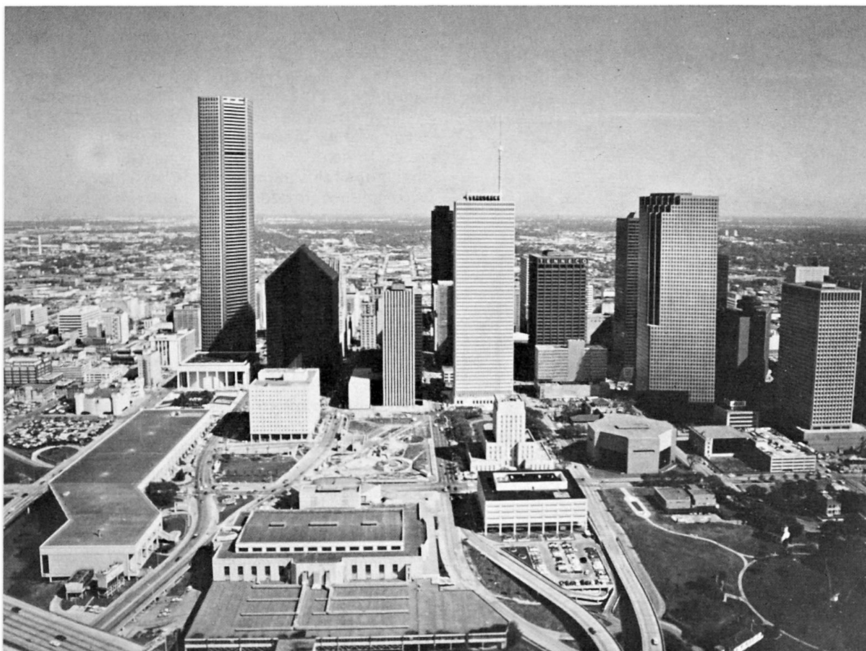
Fig. 1 Houston sky line

Rising to a height of 276 m the 75 story Texas Commerce Tower (Fig. 1) in United Energy Plaza, Houston is the tallest composite building in the world and the tallest building outside Chicago and New York.