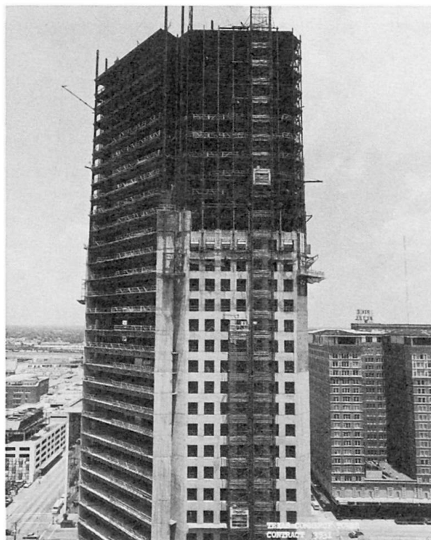
Fig. 4 Construction