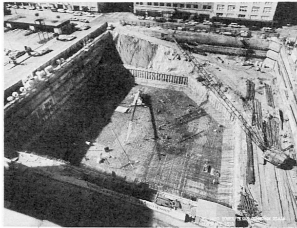
Fig. 3 Mat foundation

The 3 m thick with 11,622 m 3 of concrete was poured in two pours approximately equal in quantity. Because of the physical constraints in constructing such a mat foundation, the placement of the mat was done during weekend and at night between