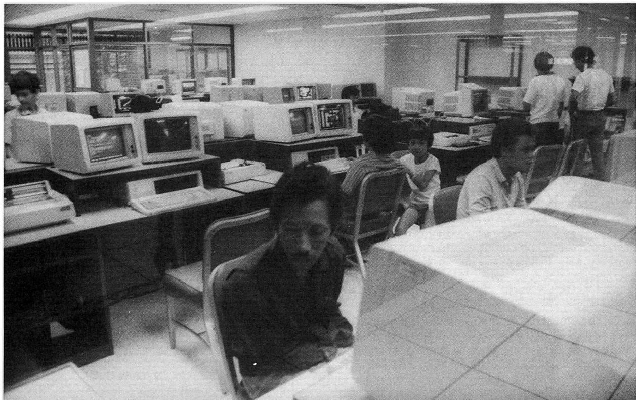
Microcomputer room in Computer Centre