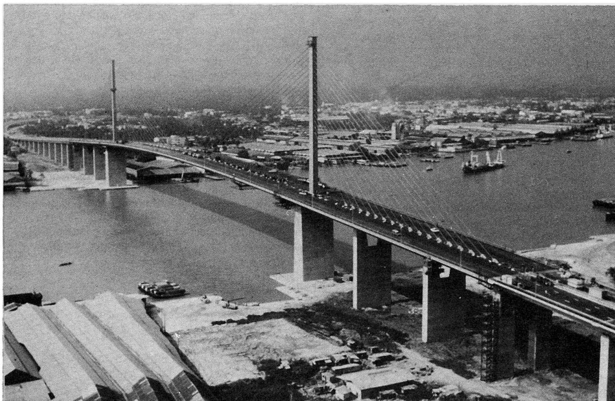
The newly completed Rama IX Cable-Stayed Bridge over Chao Phraya River in Bangkok, having a span length of 450 meters, the longest among all single-plane cable-stayed bridges.

W. Kanok-Nukulchai CABRIDGE Secretariat AIT, GPO Box 2754 Bangkok 10501, Thailand.