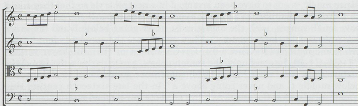
Ex. 3: „Caminata“, Florence, Panchiatichi 27, opening

The version of „Caminata“ in the Augsburg manuscript (which does have a partial B flat key signature) is essentially the same setting, though with an extra section. The Augsburg manuscript also contains a rather corrupt piece that seems to be based on the kernel of the Passamezzo moderno , the pattern I-IV-I-V in the major. These two chord sequences are by far the most common in Italian dance music, and lie behind many of the pieces printed by Attaingnant in 1530. For instance, two of the basse dances from Neuf basse dances , „La gatta in italien“ and „La scarpa my faict mal“, are elaborations respectively of the Passamezzo antico and the Passamezzo moderno .