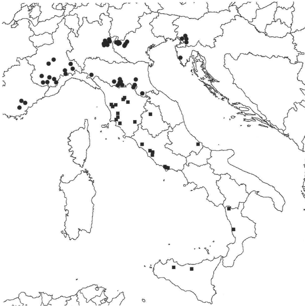
Fig. 1. Quercus crenata sensu lato: geographic distribution of the specimens seen. ● Specimens attributed to the “Northern subset”, growing where Q. cerris only is present. ■ Specimens attributed to the “Southern subset”, sympatric with both presumed parental species ( Q. cerris and Q. suber ).