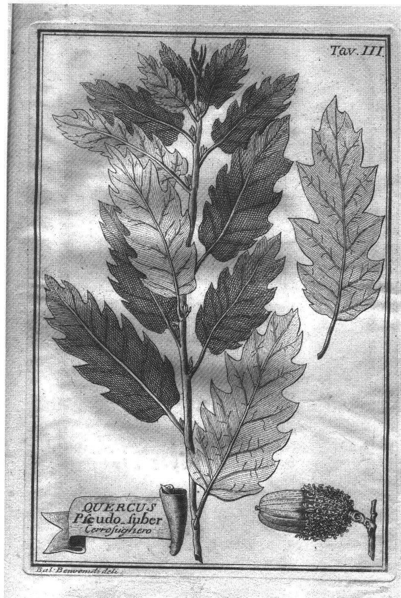
Fig. 4. Lectotype of the name Quercus pseudosuber Santi: Viaggio al Montamiata, tav. III.