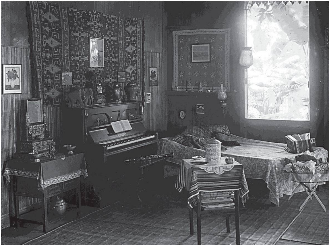
Illustration 14: Living room of the Leupold family in Tanjung Selor, ca. 1923/24

Some objects catch the modern observers' attention because we know them from our own European environment and experience, e.g. the musical instruments. The Leupolds seem to have enjoyed music and appear to have played the clarinet and piano. These instruments indicate that their players are from a cultivated European, probably bourgeois background. The accordion as a typical instrument of folk music may be linked to their home country and their lives there as young people. Maybe playing music from home was one way to deal with homesickness, maybe it just brightened up a colonial life with not much entertainment.