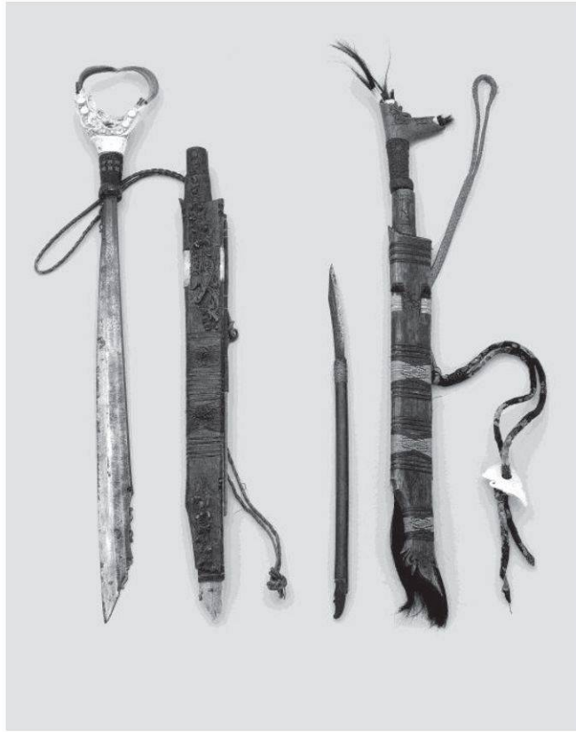
Illustration 4: Dayak swords, Leupold donation, Ethnographic Museum of the University of Zurich

wore.” 28 Bock also provides an instructive description of the effect this gift had on the local people he encountered: “The sight of my Mandau seemed to reassure her [the Dayak Rajah Dinda’s mother]. From the length of the hair tufts and the number of bead ornaments hanging from the sheath, she rightly judged that it belonged to the Sultan.” 29