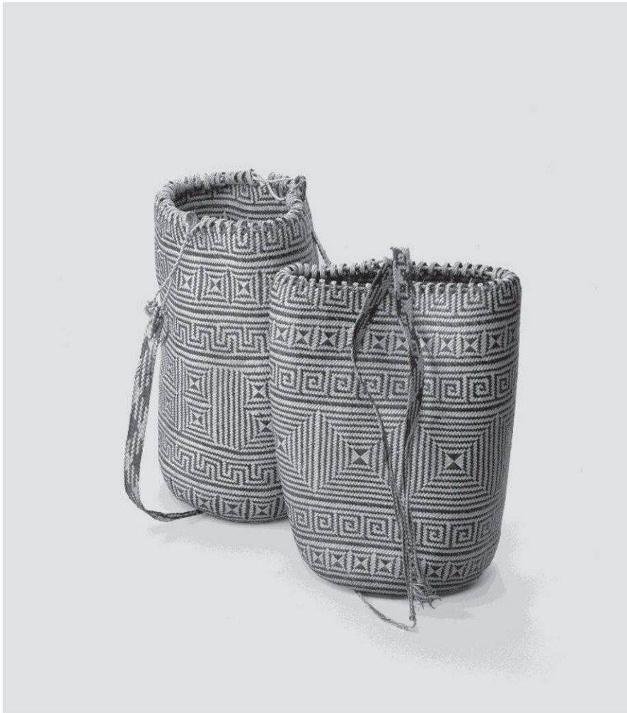
Illustration 13: Rattan baskets, Borneo, Leupold donation, Ethnographic Museum of the University of Zurich

While the jackets convey very specific information about Leupold's travels, we will now in conclusion discuss a group of artifacts that impart biographical information of quite another kind. Among the Borneo objects brought home to Switzerland by the Leupolds there is a group of cylindrical rattan baskets with shoulder straps (Ill. 13).