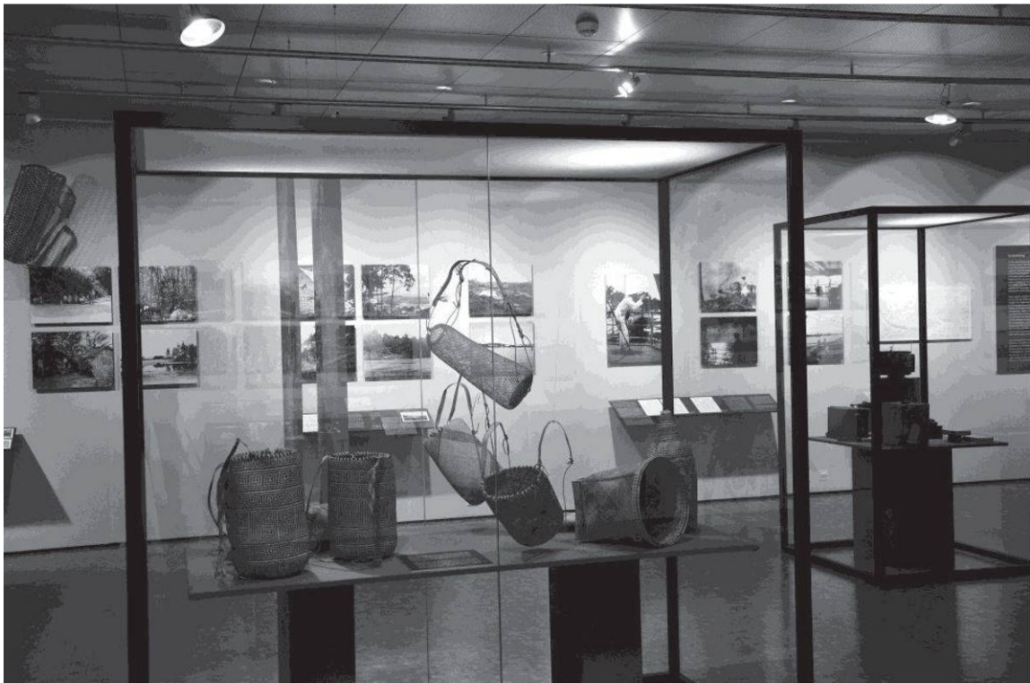
Illustration 15, 16: Aufschlussreiches Borneo (Many layered Borneo), exhibition in the Ethnographic Museum of the University of Zurich, 2011