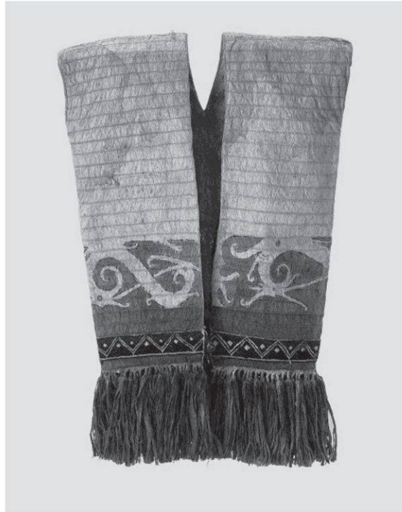
Illustration 12: Dayak bark-cloth jacket, Leupold donation, Ethnographic Museum of the University of Zurich

museum collections: four outstanding bark-cloth jackets that proved of eminent value for our research, in particular from our biographical perspective (Ill. 12).