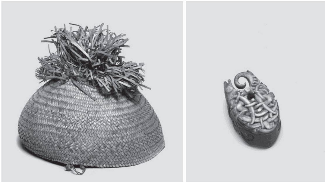
Illustration 10 (left): Dayak scull-cap, Leupold donation, Ethnographic Museum of the University of Zurich