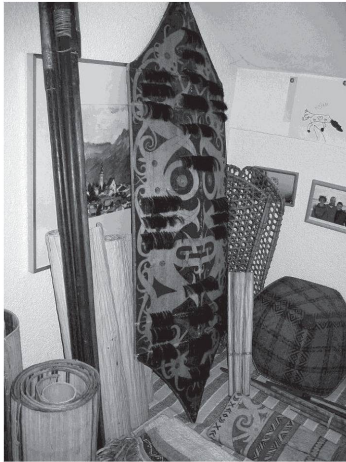
Illustrations 1, 2: Leupold family home, Zollikon, 2007