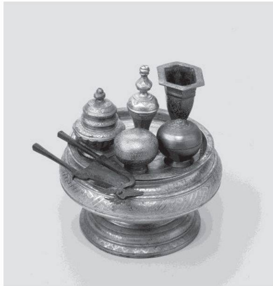
Illustration 7: Betel set, Java, Leupold donation, Ethnographic Museum of the University of Zurich

The Leupolds brought two sets and one cutter back to Europe. We showed one of these sets in the exhibition, organized in the typical and traditional manner for receiving guests, the small containers being placed on the flat cover of the large one (Ill. 7).