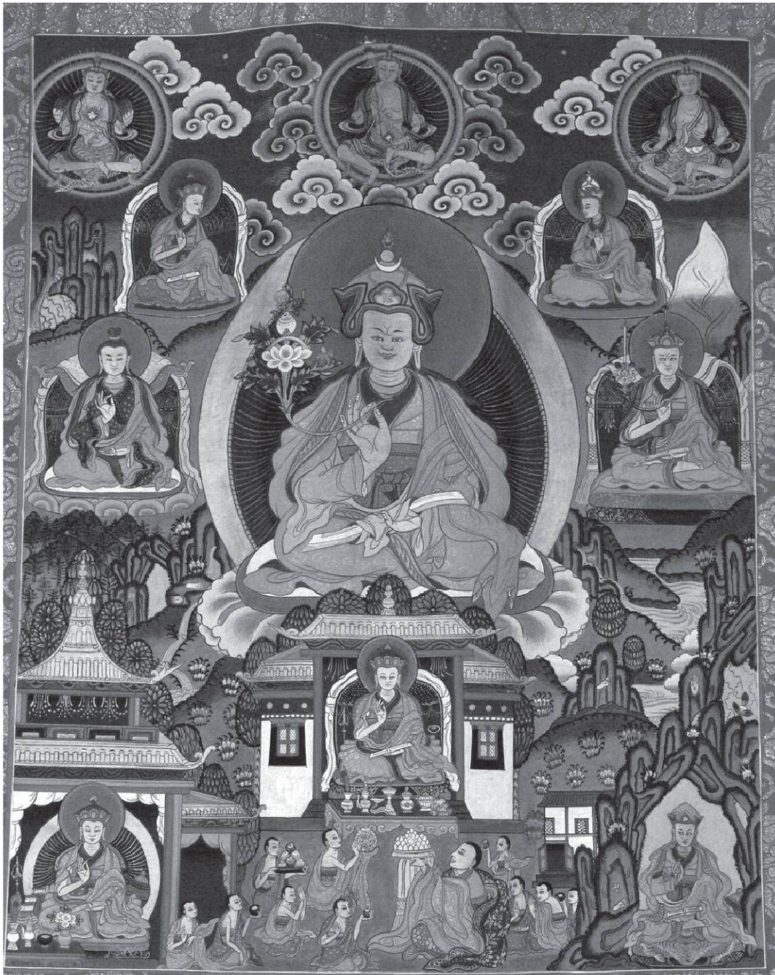
Plate 4: Thangka of the “three elevated ones” from Akyi Kyangtshang monastery. Kyangphag is in the centre, Dophag to the left and Tsophag to the right.

sras ni 'bum skyabs zhes pa bya ba 'khrungs/de ni cher skyes skyang rtse tshang zhes pa / de la sras bzhir 'khrungs pa'i tha chung ni / mtshan ni 'phags pa skyabs zhes bya ba byung /.