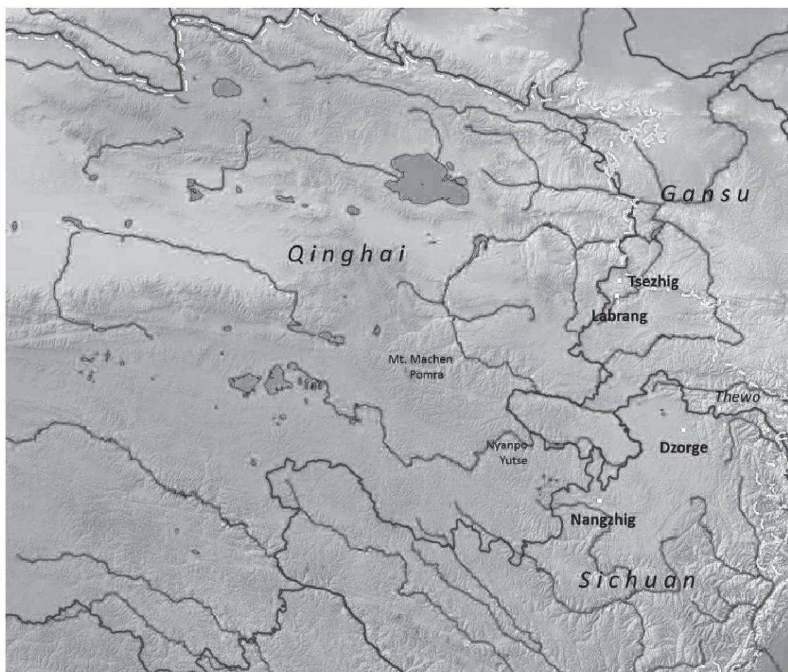
Plate 3: Map of the area.