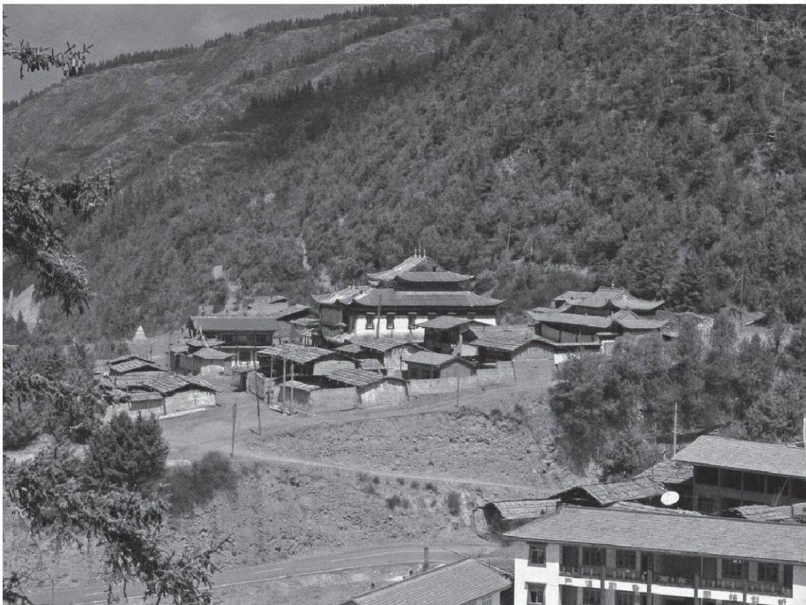
Plate 8: Gurba monastery ( Sgur ba dgon), the place of probable past Kyang family seat.

The area near Dzorge ( mDzod dge ) and in Thewo ( The bo ) is full of various stone imprints attributed to him (imprints left by the hoof of his horse, his