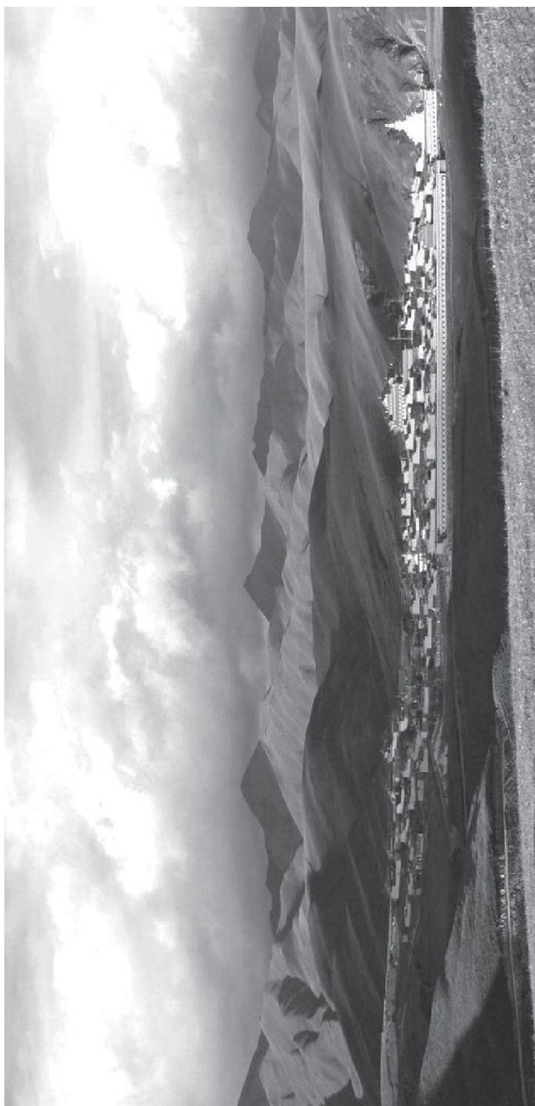
Plate 2: Nangzhig monastery (photo by D. Berounsky, 2010).