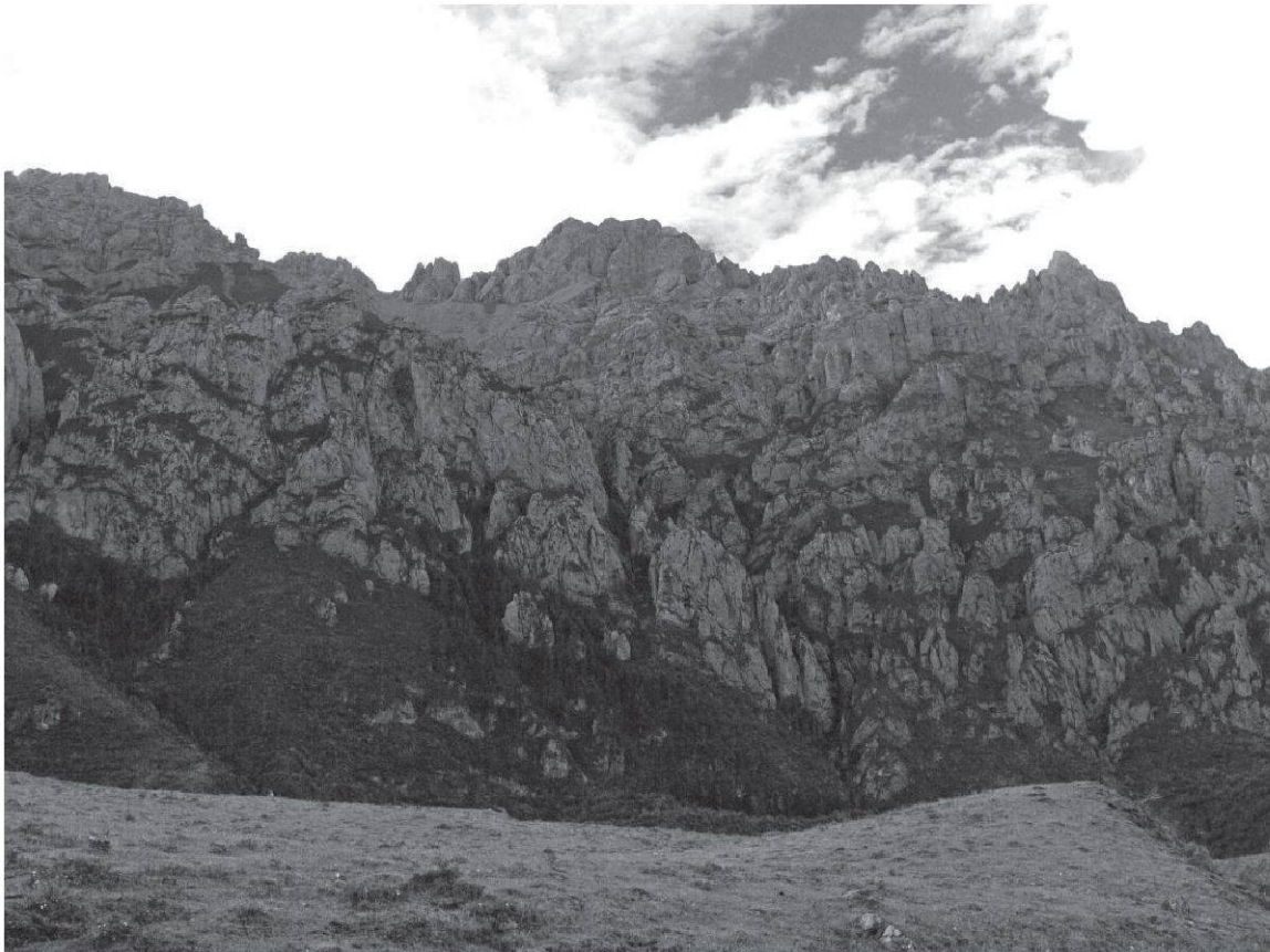
Plate 5: Dragkar Jagoe ( Brag dkar bya rgod).