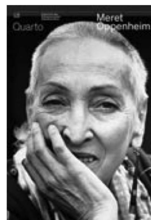
Quarto on Meret Oppenheim