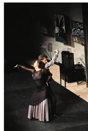
"Los Laberintos de Dürrenmatt" contemporary flamenco performance (30–31.3.2019)