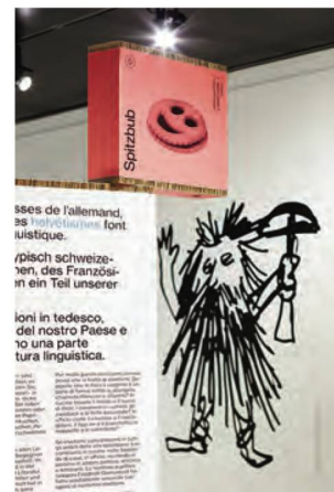
View of the exhibition "Helvétismes – Spécialités linguistiques" at the CDN (14.4.–21.7.2019)

It was an excellent year for the CDN, with exhibitions and events proving very popular with audiences, positive developments in cultural mediation, and widespread media coverage of its activities, which sometimes attracted international attention. The CDN welcomed 12 300 visitors in 2019, one of the highest figures since its creation.