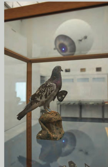
Image-recording technologies past and present

The exhibition took Spelterini's photographs from the National Library's Department of Prints and Drawings as the starting point for a history of aerial photography in Switzerland. Originated by enterprising pioneers in the century before last, the medium has now been opened up to anyone with the advent of drones. Historical images, a virtual-reality balloon flight, photographs taken from aeroplanes and satellites as well as drone images enabled visitors to see the world from a different perspective.