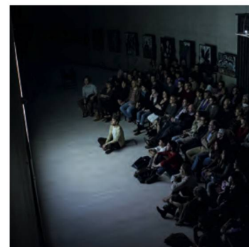
Museum Night at the CDN, 18.5.2013