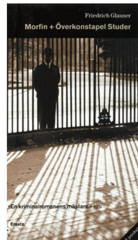
Friedrich Glauser's Wachtmeister Studer in Swedish: Stockholm, Ersatz, 2008, Sig. N 290626

A further advance in standardisation comes in the form of the German National Library's Gemeinsame Normdatei (GND, Combined authority files), which combines the various cataloguing regulations into a single entity. From early 2012, the GND will be introduced for subject indexing. There are also plans to use it for alphabetical cataloguing, but further studies will be required before this is implemented. The GND will also replace the Schlagwortnormdatei (SWD, Keyword authority control), for which the only Swiss clearing house has long been run by the NL. The major academic libraries of German-speaking Switzerland established their own SWD clearing houses during 2011.