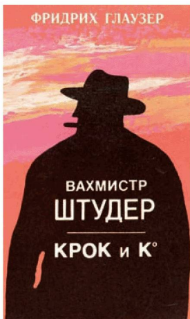
Wachtmeister Studer in Russian: St Petersburg, Kult-inform-press, 1992, Sig. Nb 61124

The Virtual International Authority File (VIAF), to which the NL has been supplying data since 2009, now matches 18 million authority files of personal names, making it an exceptionally useful research tool. Alignment of corporate data began in 2011.