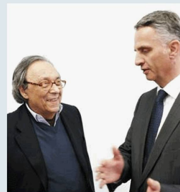
Jean Starobinski (left) in conversation with Federal Councillor Didier Burkhalter, 18.11.2010