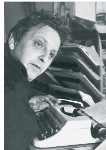
Peter Bichsel