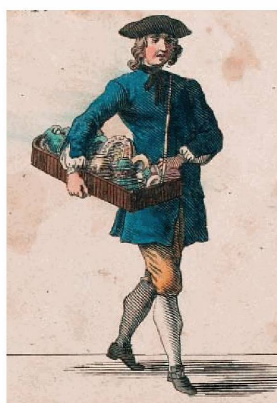
BLATTEN KRAMEN, BLATTEN. VOLFEL, THERGSCHIR, CHRUSSEN Ich hab zwar Schin und fein Geschir, Wem aber bricht, wer kan dafür?