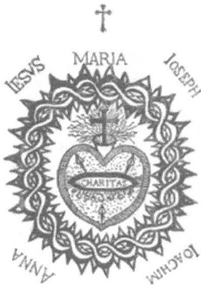
Image 3: Emblematic image of the Sacred Heart, produced originally in 1685 at Margaret-Mary Alacoque's direction.