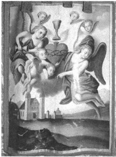
Image 1: Burning Sacred Heart with Chalice and Host, procession banner, Tirol, around 1800. 3