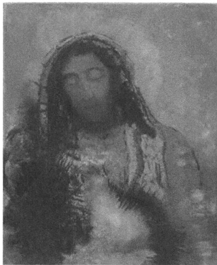
Image 5: Odilon Redon, Le Sacré Coeur , 1910, Musée d'Orsay, conservé au musée du Louvre, Paris.

Radical questioning and deconstruction of codes of religious language, and their reintroduction in new contexts as ironic citation create a complex self-reflexive relation to instances of religious memory. 14 A deconstruction and ironic reintroduction of the icon of the Sacred Heart and its staging can be analysed in modern and contemporary art, as the following two examples shall show. In Salvador Dali's The Sacred Heart of Jesus (1962), 15 the seriality of Sacred Heart iconography is exposed: The card that the figure of Christ (resembling a pop singer) is holding like a devotional image is strikingly displayed as article of daily use and mass production. Christ's gestus of showing is uncovered, ironised and deconstructed – a typical effect of alienation/defamiliarisation ( Verfremdung ) – by a Christ who no longer identifies with the heart he displays. The heart on the card is decorporalised, whereas Christ is exclusively «body», bringing to expression what the rite has turned it into: the icon though transformed is still recognizable, but has lost its meaning. Damian Hirst's several recent Sacred Heart sculptures – again expression of the play with seriality, with different titles, however referring to the Sacred Heart iconography – are radical, ironic alienations citing central narratives and exposing them (doubly) in containers filled with formaldehyde. 16 The latter stands for the human and not transcendent creation of eternity and immortality,