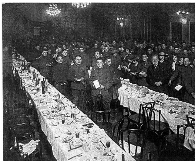
Picture 1: Passover Seder, April 1919, provided for American Jewish soldiers in France by the Jewish Welfare Board. Attendees are standing to sing «The Star Spangled Banner».