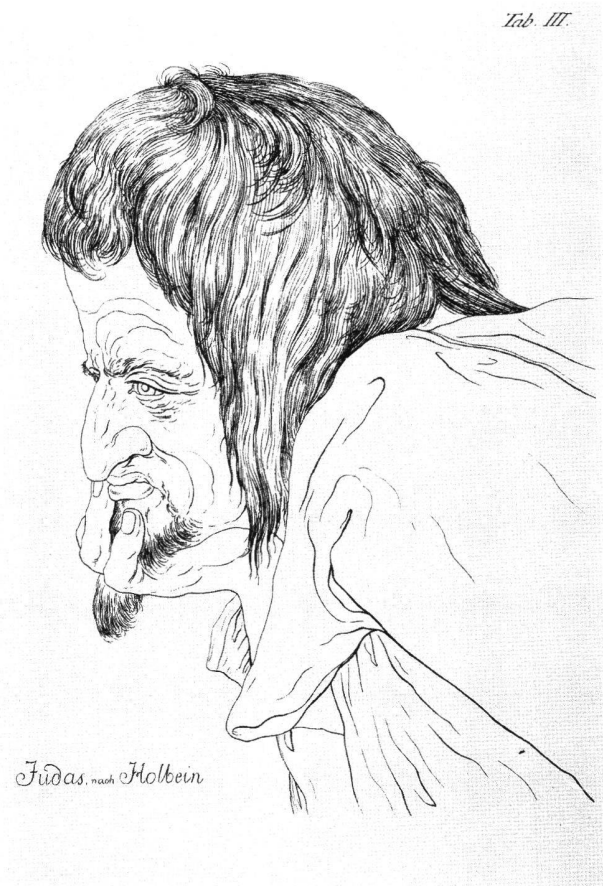
Fig. 4 Judas, as painted by Holbein in the Basle Last Supper. Illustration from Johann Kaspar Lavater, "Physiognomische Fragmente, zur Beförderung der Menschenkenntnis und Menschenliebe", Leipzig/Winterthur 1775–1778, 4 vols.

house a portrait that he had just finished for one of his patrons – on the forehead he painted a fly, and sent the picture to the person for whom it was designed. The gentleman struck with the beauty of the piece, went eagerly to brush off the fly – and found the deceit." 39 Much more important was the outlook that Walpole cast on Holbein's