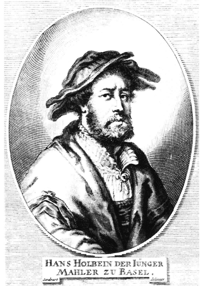
Fig. 3 Hans Holbein the Younger. Illustration from Joachim Von Sandrart, "L'Accademia Todesca della Architettura, Scultura et Pittura, oder Teutsche Academie der Edlen Bau-, Bild- und Mahlerey-Künste", 2 vols., Nuremberg and Frankfurt 1675–1679, I,2 p. 249.

market, the Grand Duke wrote to Arundel, and begged him to part with a jewel from his own stock, "because I have become passionately set upon having a work by this artist". 22 Arundel duly behaved as a perfect courtier, surrendering the only Holbein portrait which he could not