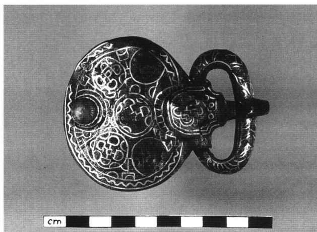
Fig. 1 Artifact from Schleithelm, Hebsack; Kanton Schaffhausen: treated according to parameters used until 1989, corresponds to corrosion scale 0. It has been in a controlled storage environment since 1990.

A comparison of different types of conservation treatments for metal, such as mechanical cleaning, protective coatings, stable storage conditions and various applications of the plasma method, has shown that no single treatment solves all the problems generally encountered with metal artifacts. The investigation of low pressure plasma is part of the search for an appropriate conservation treatment for iron-work and other metals.