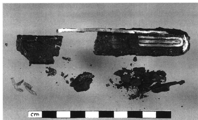
Fig. 3 Artifact from Schleithelm, Hebsack; Kanton Schaffhausen: treated according to parameters used until 1989, corresponds to corrosion scale 5. It has been in a controlled storage environment since 1990.

Prior to plasma treatment, all artifacts are dried in an oven which is evacuated to a pressure of about 2 mb. This procedure helps to create an even discharge within a very short