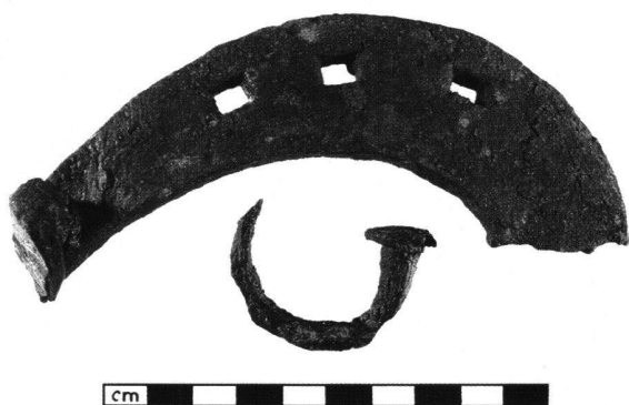
Fig. 2 Artifacts from Wartau, Ochsensberg; Kanton St. Gallen (excavated by the University of Zurich): treated according to parameters used until 1993, correspond to corrosion scale 3.

Plasma is a well-known physics field and has been applied to metal conservation for several years. Under the supervision of Stanislav Vepřek in the 1980's, it was Jörg Pat-scheider at the University of Zurich who first proposed the application of plasma for the cleaning and possible preservation of iron artifacts 1 . A collaboration was initiated between the Institute of Inorganic Chemistry at the University and the Swiss National Museum.