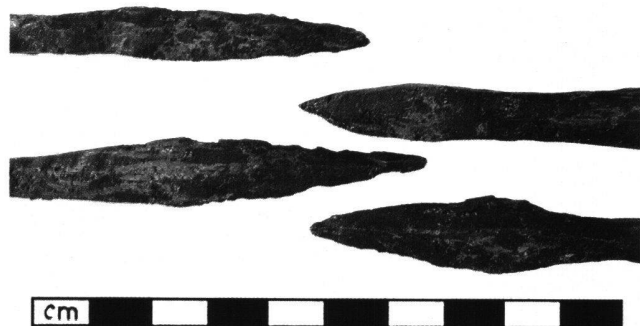
Fig. 4 Artifacts from Uster-Nänikon, Bühl, Kanton Zurich: treated in 1993 (without desalination, etc.); 2 years after conservation was completed.

used for the last eight months; prior to that it was B48 N 12 . The decision to coat artifacts with an acrylic resin, rather than the microcrystalline wax used as standard before this, was made because of the better reversibility properties of the acrylic resins and for the aesthetic appearance they give.