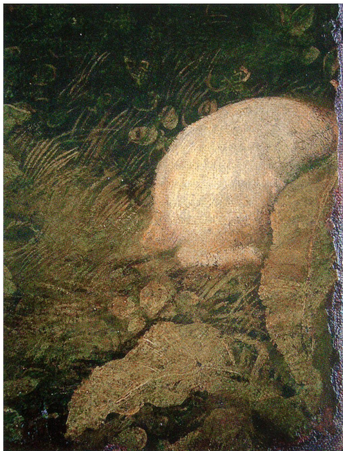
Fig.2 La Vierge au lapin, Titian, 1530. Oil on canvas, 71 × 87 cm, Musée du Louvre, Paris, Inv. 743.