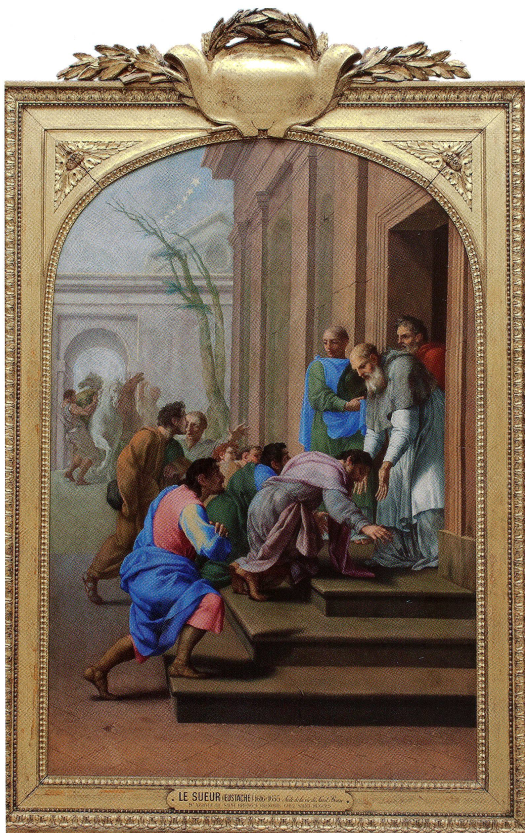
Fig.7 Arrivée de Saint Bruno à Grenoble, chez Saint Hugues , Eustache Le Sueur, 1645–1648. Transferred from panel to canvas by F.-T. Hacquain, 193 × 130 cm, Musée du Louvre, Paris, INV 8033.