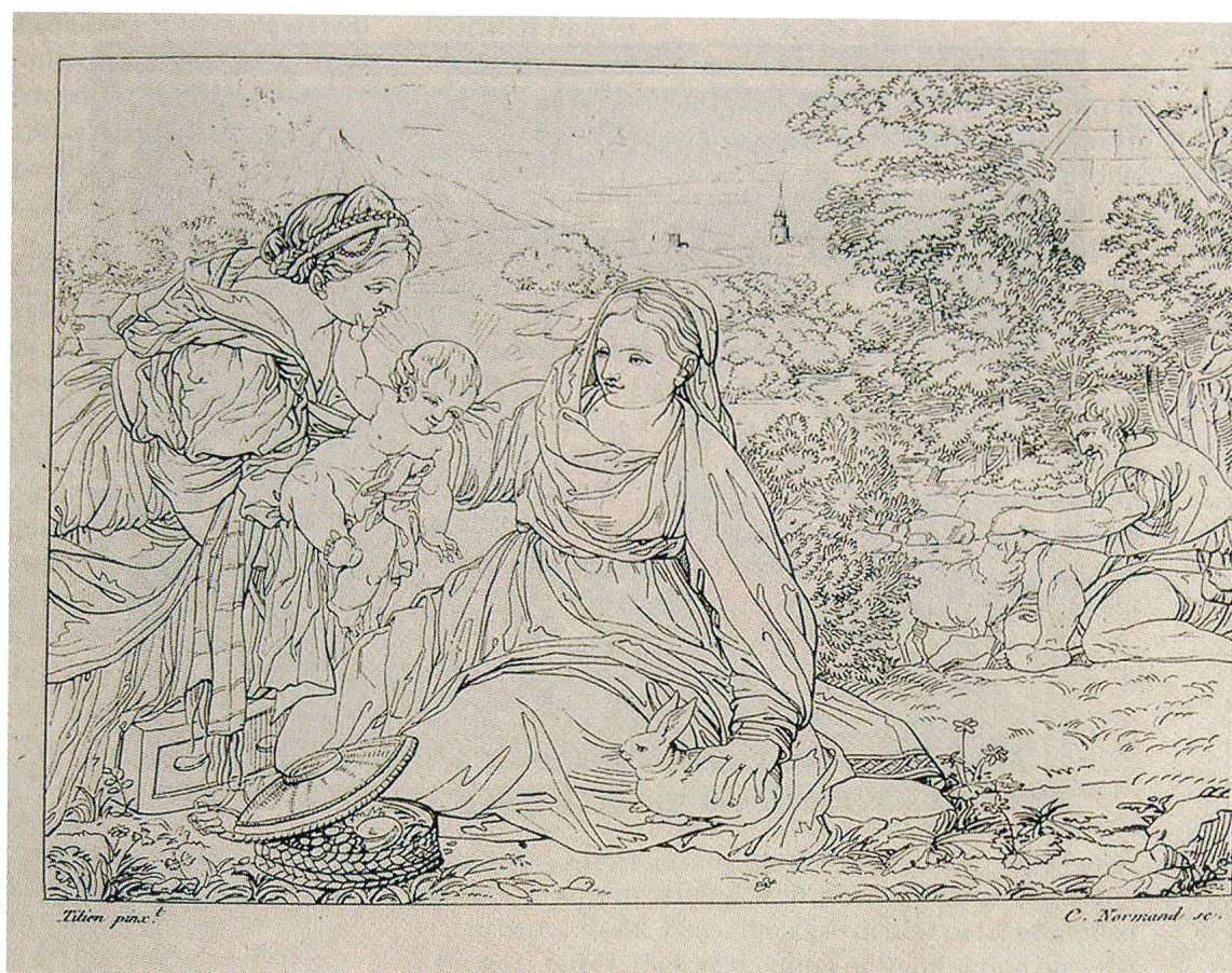
Fig.3 La Sainte Famille, dite la Vierge au lapin , after Titian. In: LONDON, Vies et œuvres des Peintres les plus célèbres, de toutes les écoles 1803–1809 , pl. 2.