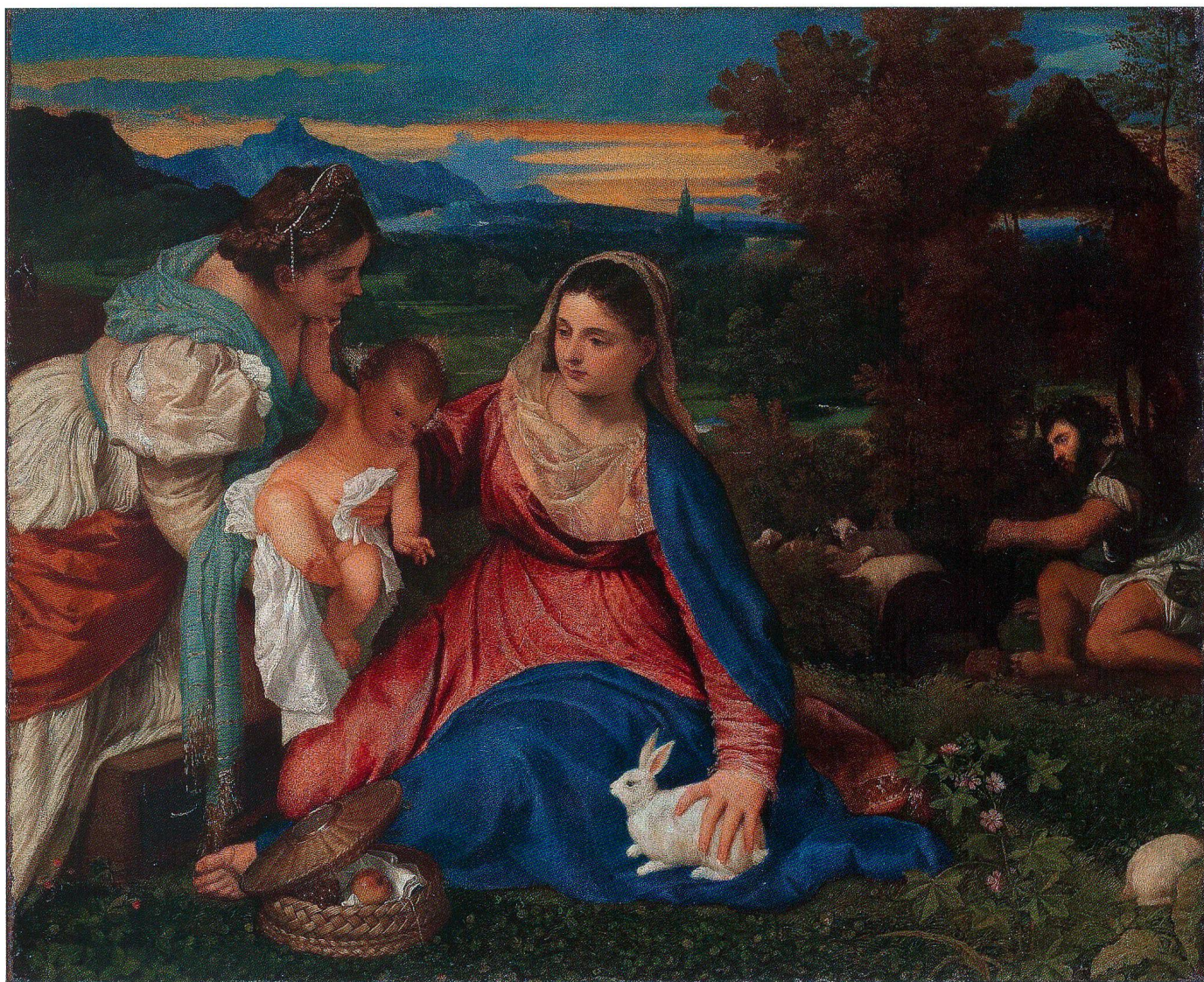
Fig. 1 La Vierge au lapin , Titian, 1530. Oil on canvas, 71 × 87 cm, Musée du Louvre, Paris, Inv. 743.

(Fig. 2): 1 during a conservation campaign in the 1990s, it was determined to be the result of a 19 th century re-painting. 2 According to a committee report of January 17, 1991, «the participants' attention is drawn to a motif shaped like a rabbit, whose body is cut off at its extremity at the bottom right side of the painting. Ms. Malpel notes that the fur's white paint layer is very worn out, and that