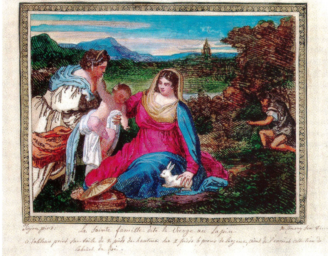
Fig.5 La Sainte Famille, dite la Vierge au lapin , after Titian, Maria Cosway, drawing, c. 1800.