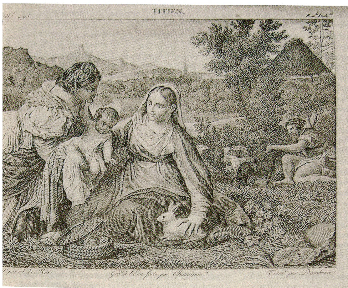
Fig.4 La Sainte Famille, dite la Vierge au lapin , after Titian. In: JOSEPH LAVALLÉE, Galerie du Musée Napoléon , Filhol, 11 vol. t. 7, 1810.