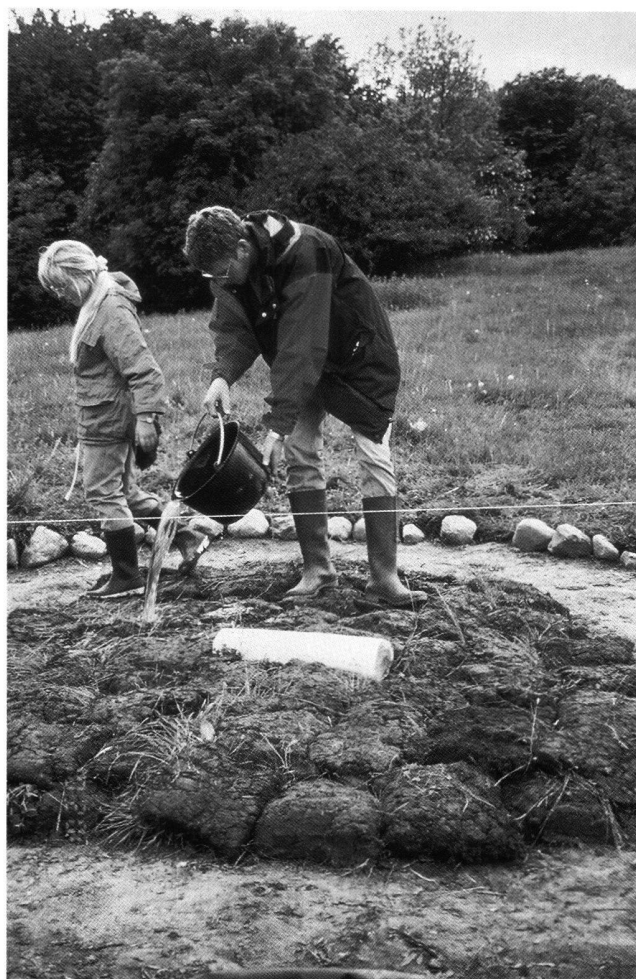
Fig. 7a The horizontal layers of sods in the core of the burial mound model were wetted and walked upon for compaction.