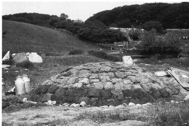
Fig. 7b The finished burial mound model was about 1.1 m high.

interpreted archaeologically. In 1998 the barrow was excavated (Fig. 7c), and in spite of difficult chemical preconditions, it was demonstrated that the soil-chemical processes of an iron pan could be established in this way, and further that a unique preservation state of the burial was achieved (Fig. 7d). 9