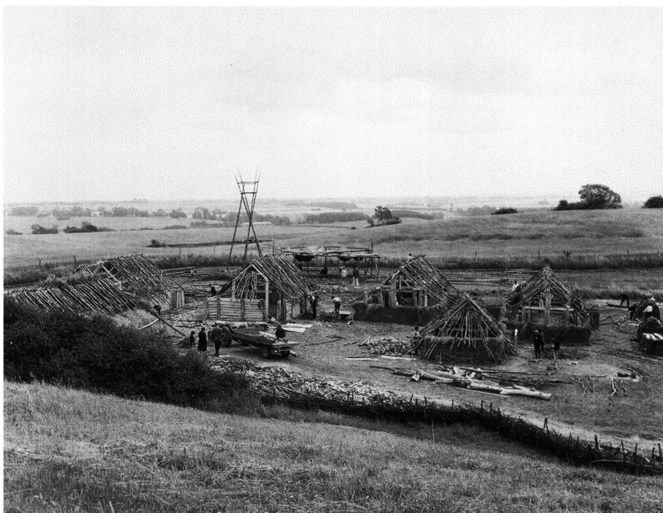
Fig. 1 A model of an iron age village was established in 1964. It is still the best known and core part of the centre.

During the past 35 years, the focus on the three “legs” of the centre – education, public demonstration, and research – gradually changed. In the seventies and early eighties the educational and public parts grew significantly and received much acknowledgement from the outside world. Research was reduced to a very modest level, and experiments were conducted without any connection to the established academic archaeology in Denmark. It could not satisfy scientific demands and therefore did not earn any credit.