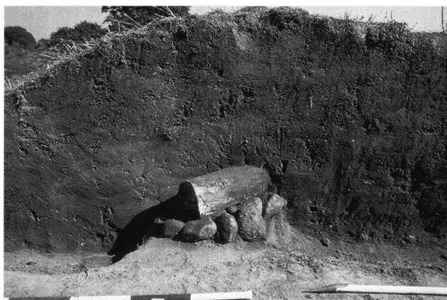
Fig. 7c The core and mantel of the burial mound model could easily be distinguished in the profile during excavation.