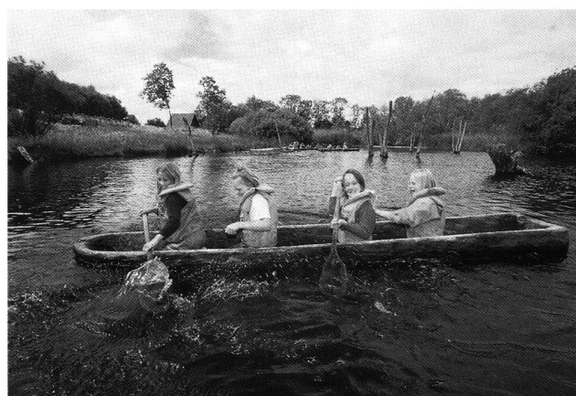
Fig. 3 Every season about 20.000 children take their way through the experiences and simple learning of the Fire Valley and spend many hours here.

years, the houses have been built and pulled down, fences and fields established, taken down or moved. Varying experiments with iron smelting, revolving querns, kiln building, the pruning of trees and bushes, and many more have left their marks on the village and its surroundings. The iron age village houses all dimensions of the centre's activities. It demonstrates Danish iron age living conditions to the public, it contains daily and structured visiting-programmes for schoolchildren and it is the field of many experiments among which the most famous is the experimental burning down of a full-scale house model. The activities include the so-called “prehistoric families”. These are ordinary families, who spend part of their summer holiday living like inhabitants of an iron age village. Their diet, their clothes and their equipments are in line with our most recent interpretations of iron age habits. Thus they form a living part of the reconstructed environment and of our specific understanding of it (Fig. 2).