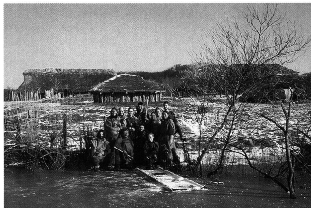
Fig. 8 When studying the environment in the iron age full-scale house-models at Lejre, it must be kept in mind that it is our own interpretations we study.

tion as it is done in Lejre. Obviously, it would be much easier without the “disturbance” by children and visitors. On the other hand, such combined centres are the perfect stage for keeping alive public interest in archaeology – and consequently maintaining a public funding of archaeology. The centres must also serve as stages for good interpretation of primitive, but clever technology, a task that in the end would benefit such noble purposes as increasing tolerance and avoiding alienation among young people.