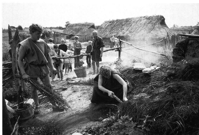
Fig. 2 Fruitful dialogues often arise between the families living in the reconstructed environments and the visitors of the centre.

The iron age village is surrounded by pastures, meadows, fields, and a wood with a sacrificial bog. All is part of the reconstructed environment. A small stone age area is another reconstructed environment. It is not permanently staffed, but occasionally it houses research projects as well as teaching-sessions for schoolchildren. Finally, the so-called farmcottages must be mentioned. They provide a reconstructed smallholder environment from around 1850 AD. The environment comprises two dwelling houses, a workshop, fields, and very beautiful gardens. The area is mainly used for interpretation and teaching programmes. Similar to the houses in the iron age village, the farmcottages are built to be used, and in the summertime they are inhabited by “historic families”.