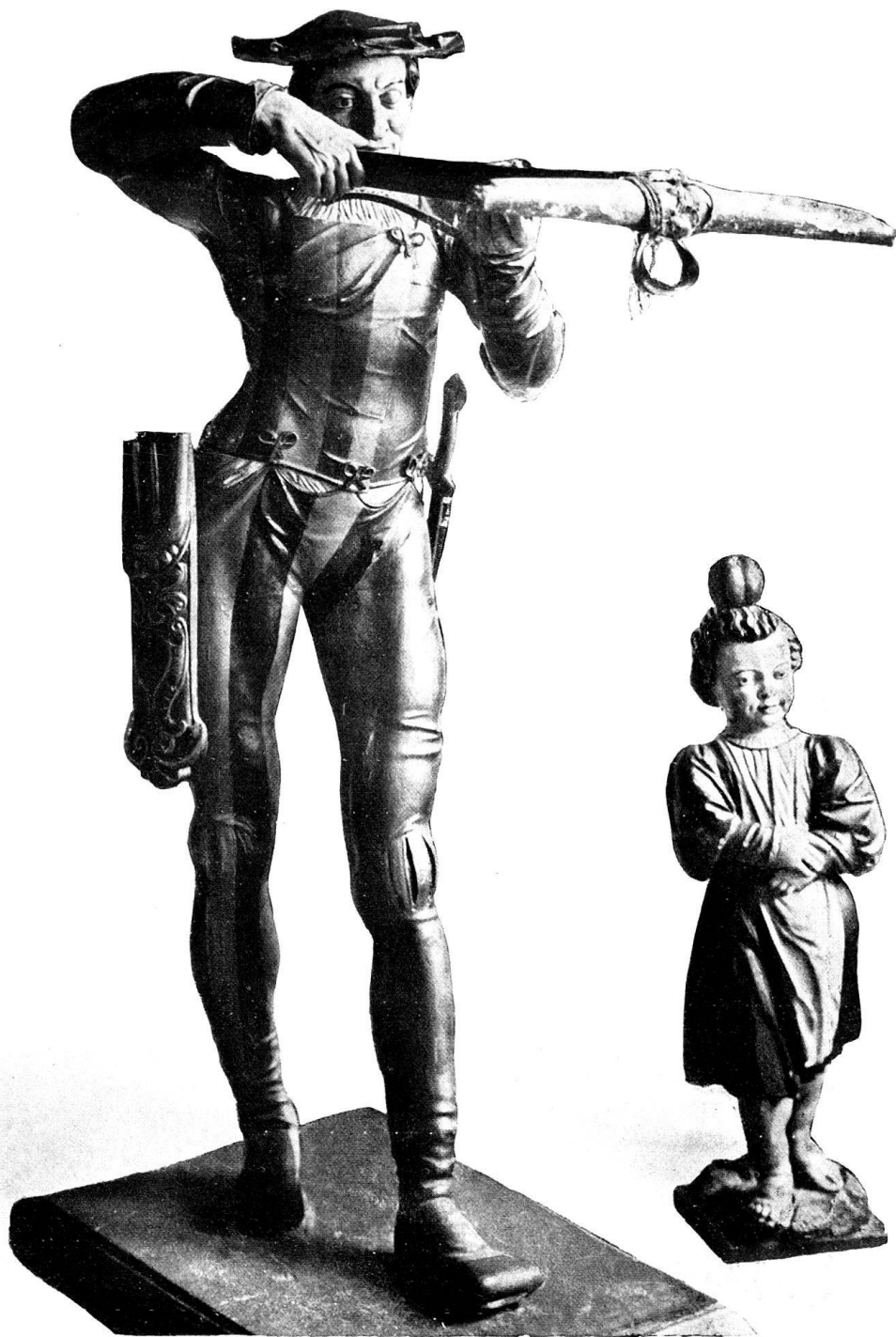
TELL UND SEIN KNABE.