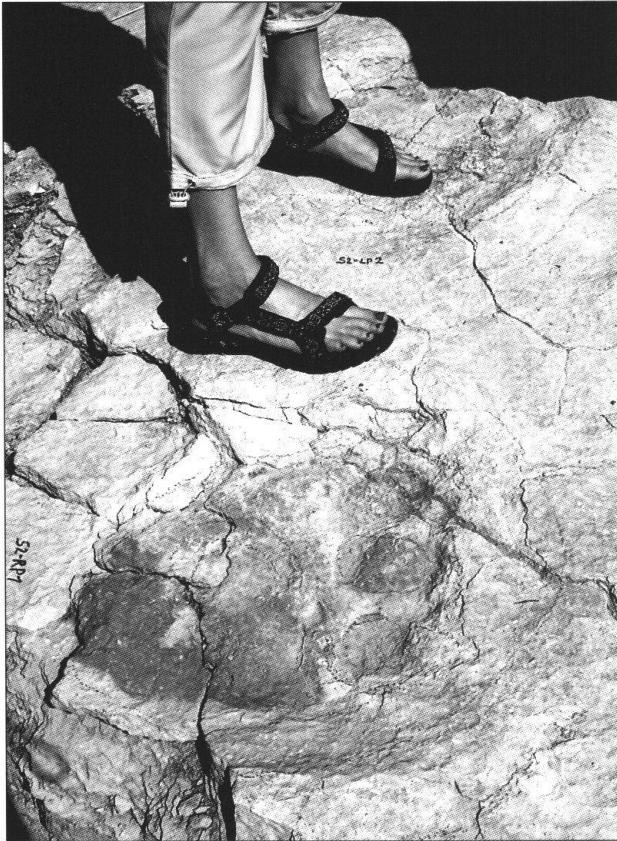
Fig. 2: Courtedoux-Tchafoué: Sauropod imprint (and human feet).