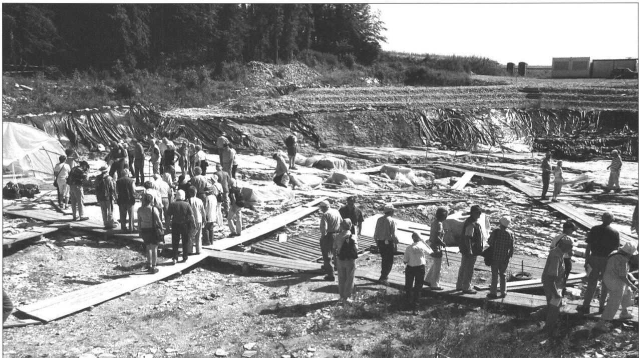
Fig. 1: Courtedoux-Tchafoué: Excavation for the planned Motorway A16, where Dinosaur tracks were discovered.