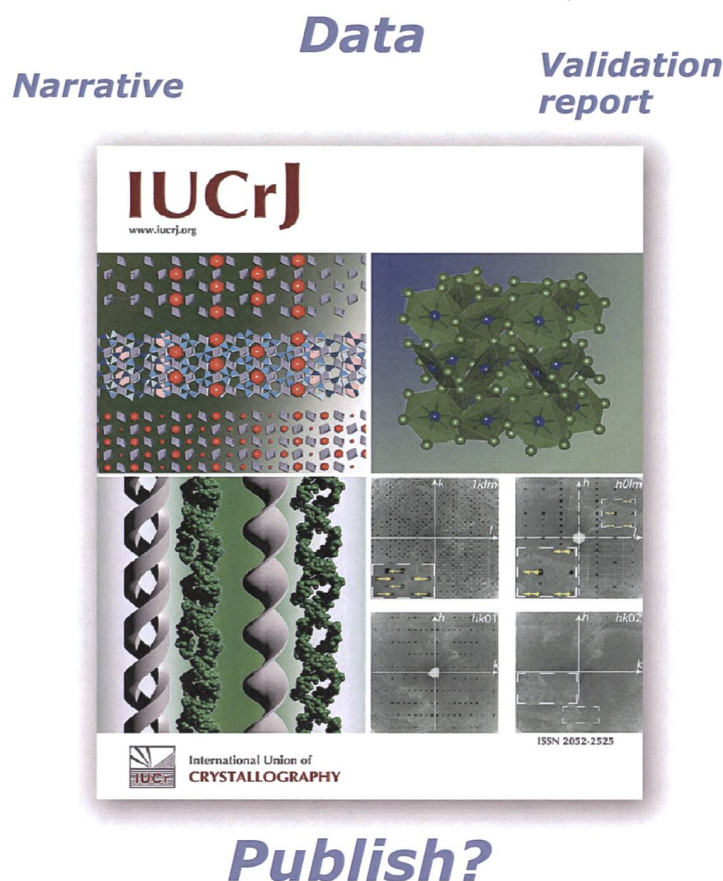
Figure 1. The Editor as the gatekeeper of reproducible science knowledge and on which basis replicability by others, and ultimately wisdom, can rely.

improve them and reduce variations in analysis. An early example of software improvement for processing of raw data (oscillation camera diffraction images recorded on film) was the comparative “round robin” project of Helliwell et al. (1981).