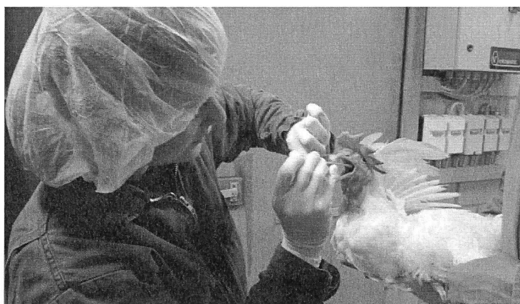
Figure 2. Swabs are collected for disease surveillance in a poultry farm. Regular surveillance of animal health can contribute to the protection of humans from zoonotic diseases.

An important aspect of any study of diseases in populations is diagnosis and good diagnostic tools are essential if we want to investigate the societal burden of a disease. Diagnostic tools help us to confirm the presence of diseases in individual animals and in groups of animals within populations. However, very few diagnostic tools are 100% accurate. Occasionally,