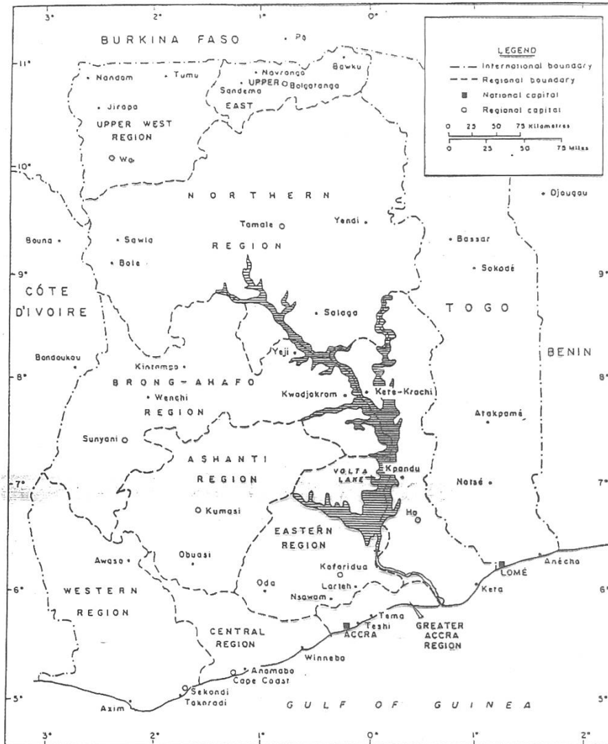
Ghana. Department of Geography and Resource Development, University of Ghana.

Crevecoeur 1649), the English (James Fort 1673), and the Danes (who took over Christiansborg in 1659), and the city grew in several semi-autonomous divisions or "quarters", based on trade with these lodges which were expanded into forts.