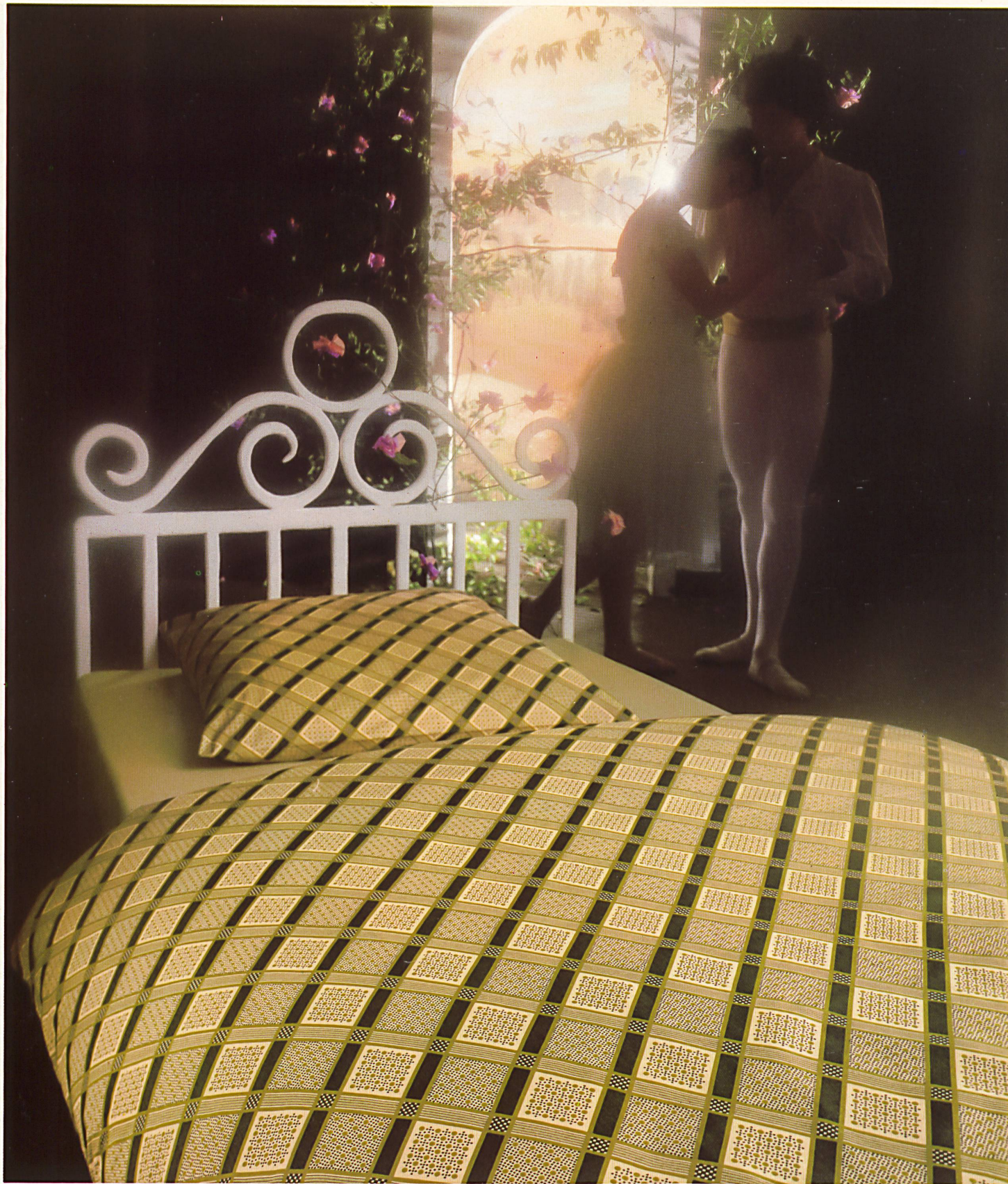
"Quadro", a geometric design in harmonious colours on beige ground from the Studio collection. The severity of the diagonal squares is softened by tiny dots. Colour-matched to the "Muralto" range, combined here with a "Jersey/Stretch" fitted sheet in "Muralto" olive.