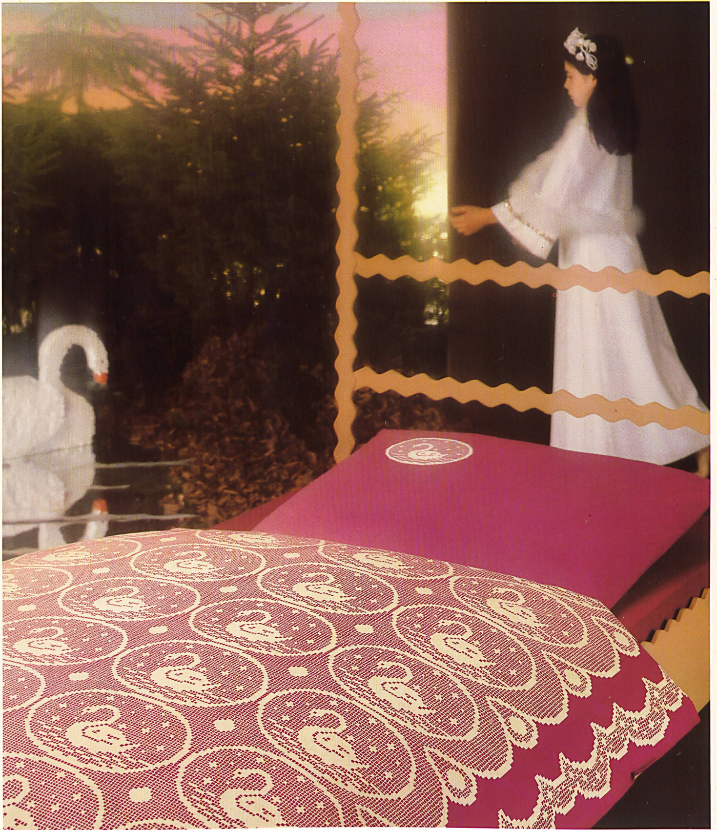
“La Belle Epoque”, nostalgic swan design with exclusive lattice tulle effect; the romantic printed design is repeated on the pillow case with an appliquéd embroidery motif; available in claret, brown, navy blue, cinnamon; matching “Ideal-Stretch” fitted bottom sheets.