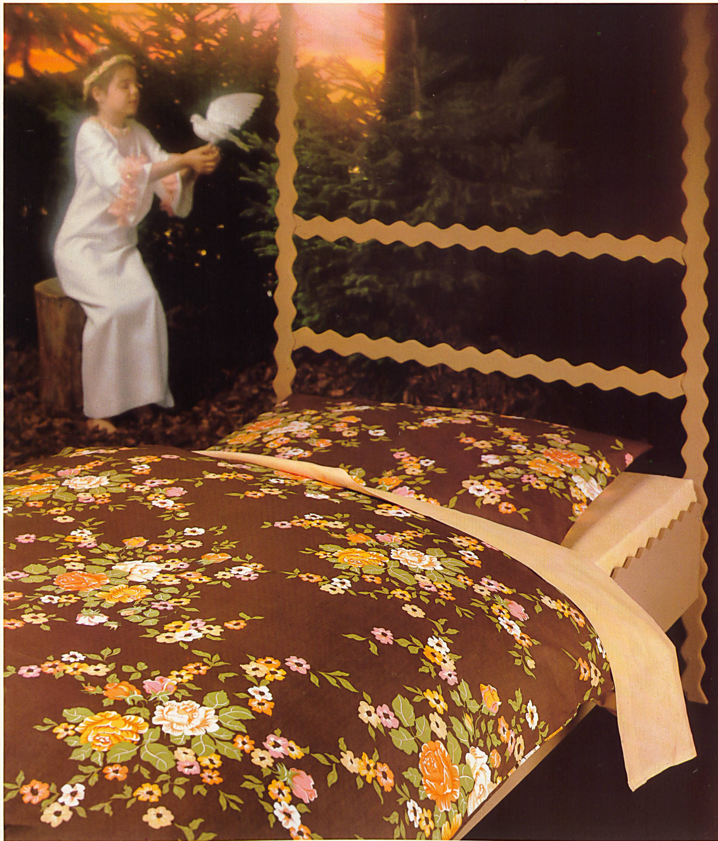
Lovely floral design in bright colours on a dark ground. The percale covers are shown with the colour-matching percale sheet and a "frotté" fitted bottom sheet.