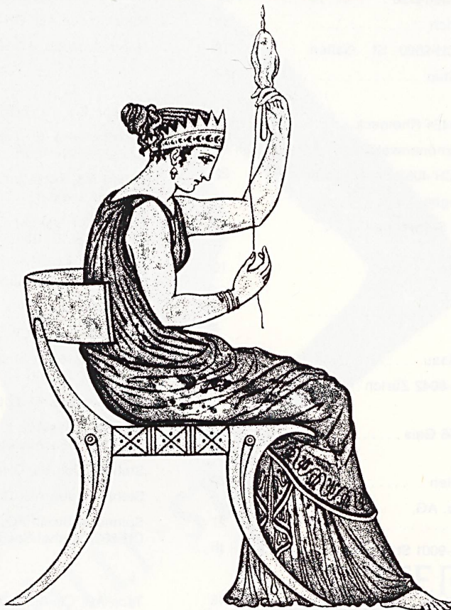
Femme qui file - Représentation grecque ancienne.

La tradition grecque dans le textile et le vêtement se perd dans la nuit des temps. Dans le poème de l'Odyssée, nous apprenons que Pénélope tissait pendant 20 ans en attendant le retour d'Ulysse.