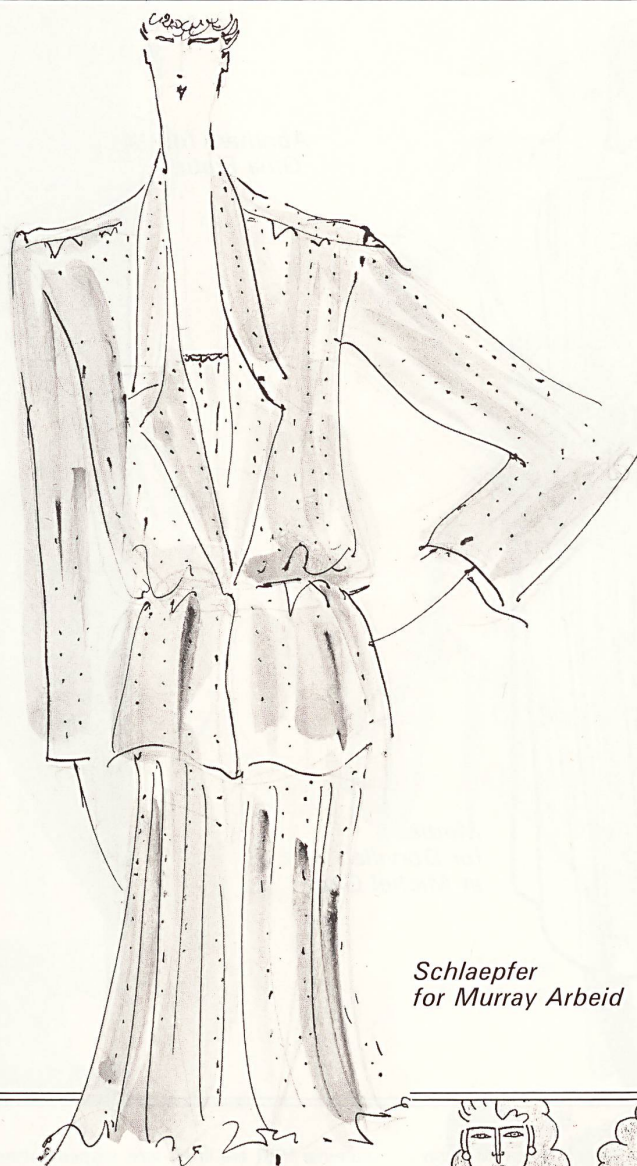
Schlaepfer for Murray Arbeid