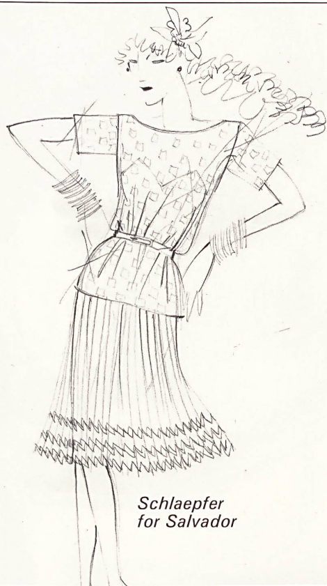
Schlaepfer for Salvador