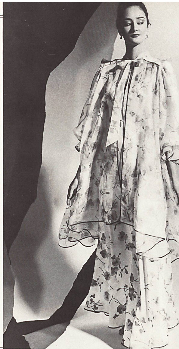
Schubiger for Murray Arbeid