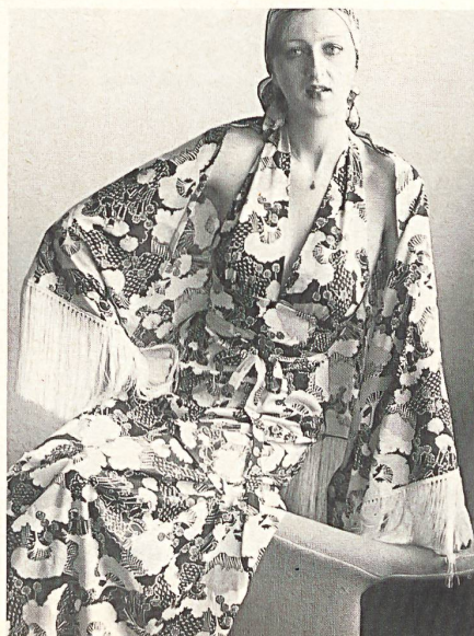
TACO AG, GLATTBRUGG Printed cotton voile.