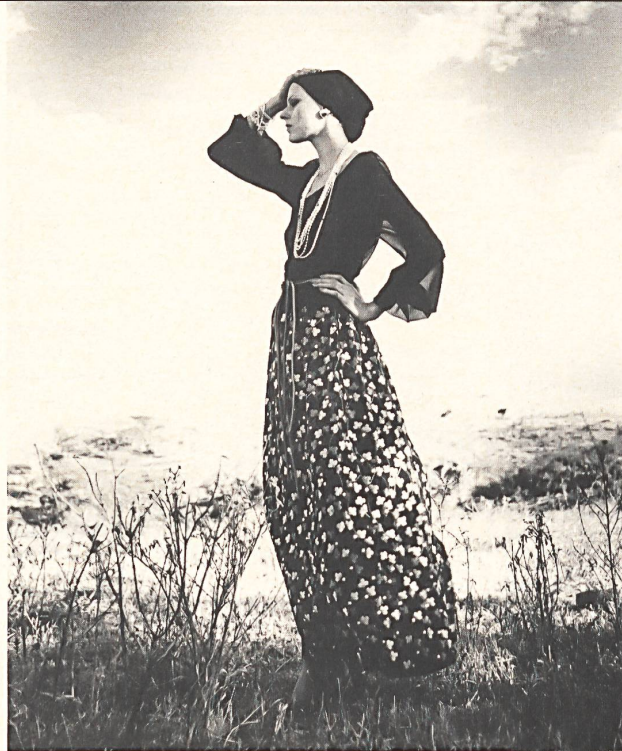
Long skirt in multi-coloured embroidery on black ground by Union Co. Ltd., St. Gall