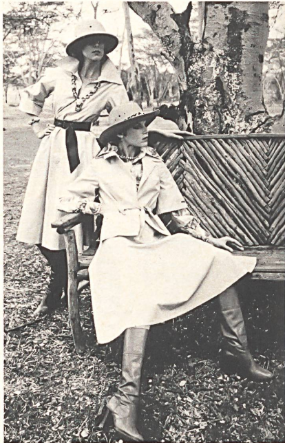
Modern safari-look dress and two-piece outfit in cotton/Dacron® poplin by Stoffel Co. Ltd., St. Gall