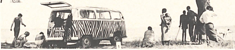
Blouse and skirt in cotton voile and piqué print by Christian Fischbacher Co. Ltd., St. Gall