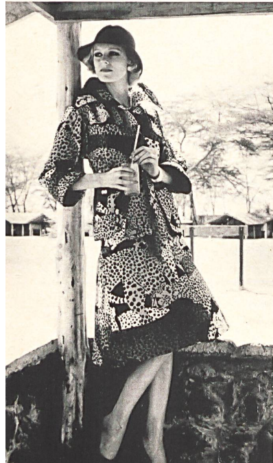
Original suit in cotton reps with the exclusive leopard print by Abraham Co. Ltd., Zurich

ings, the hospitable "Intercontinental" hotel in Nairobi, which also had a part to play, made arrangements for a gala evening featuring a showing of JOCELYN® fashions. Under the patronage of Mama Kenyatta, wife of the President of Kenya, the party got off to a good start with the fashion show, for which the jewellery was kindly loaned by the jewellery firm of Bucherer. The goodwill tour, generously backed by the firms taking part, enabled the cream of Kenyan society to become acquainted with Swiss ready-to-wear creations, and in a few weeks' time a wide section of the Swiss public will also discover more about this new name in fashion through the reports on Kenya in the two magazines.