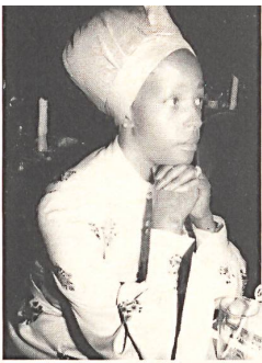
Blouse and skirt in cotton voile and piqué print by Christian Fischbacher Co. Ltd., St. Gall