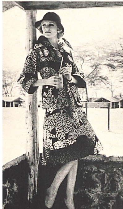
Original suit in cotton reps with the exclusive leopard print by Abraham Co. Ltd., Zurich

ings, the hospitable "Intercontinental" hotel in Nairobi, which also had a part to play, made arrangements for a gala evening featuring a showing of JOCELYN® fashions. Under the patronage of Mama Kenyatta, wife of the President of Kenya, the party got off to a good start with the fashion show, for which the jewellery was kindly loaned by the jewellery firm of Bucherer. The goodwill tour, generously backed by the firms taking part, enabled the cream of Kenyan society to become acquainted with Swiss ready-to-wear creations, and in a few weeks' time a wide section of the Swiss public will also discover more about this new name in fashion through the reports on Kenya in the two magazines.