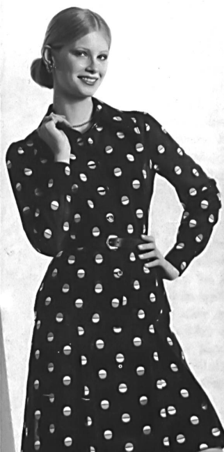
4. STÜNZI SONS LIMITED, HORGES Elegant day dress in pink/white coin print on acetate/polyamide featuring pussycat bow and keyhole front.