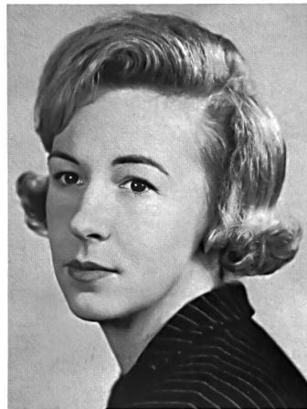
WEISBROD-ZÜRCHER AG HAUSEN a.A.

Full length evening gown in white "Lascara" pure spun viscose, with navy blue shawl and white flowers.